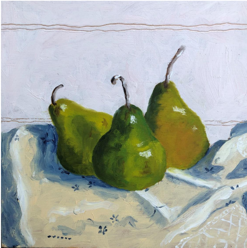
'Still life 9'; oil on board, 21x21cm, $650