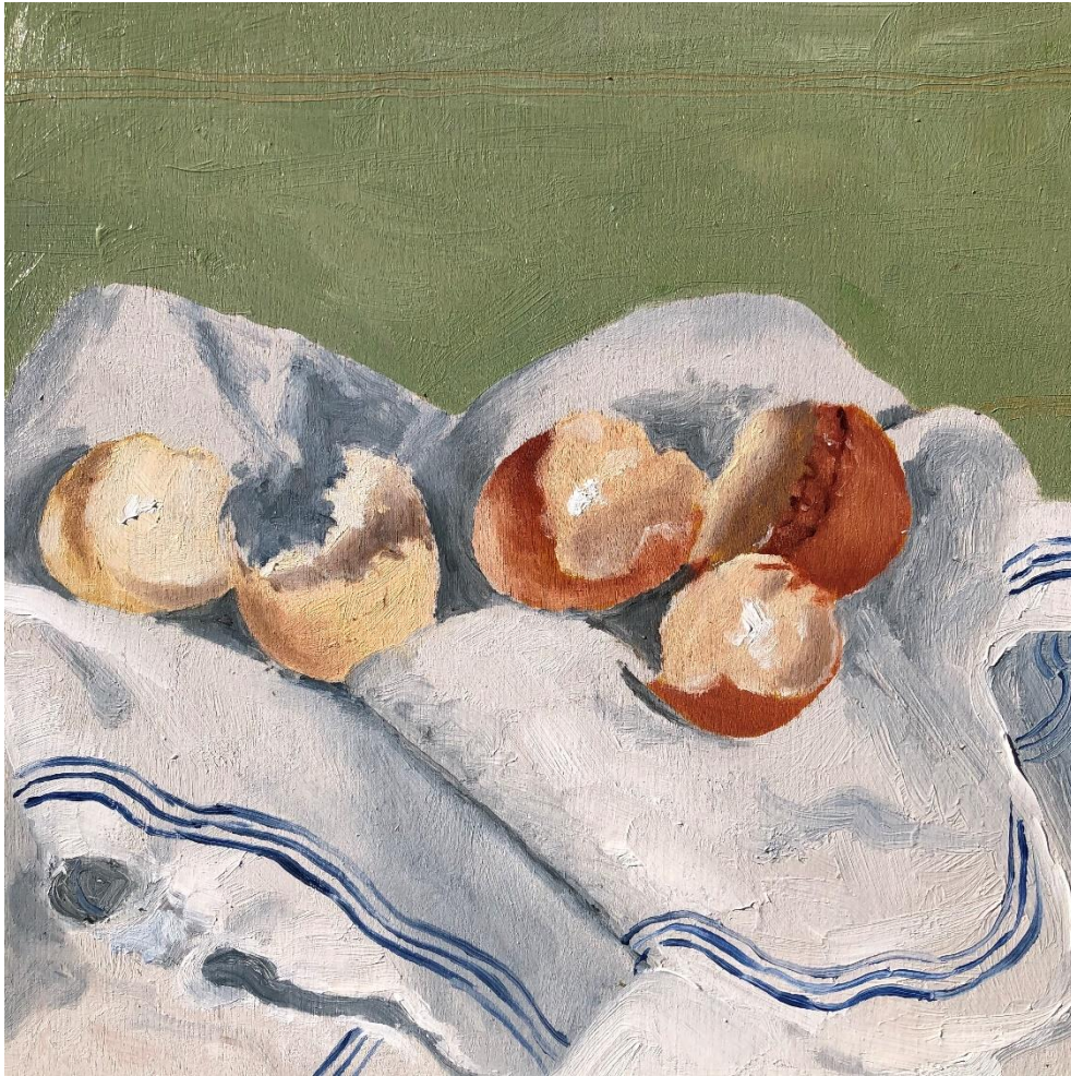
'Walking on egg shells'; oil on board, 21x21cm, $650