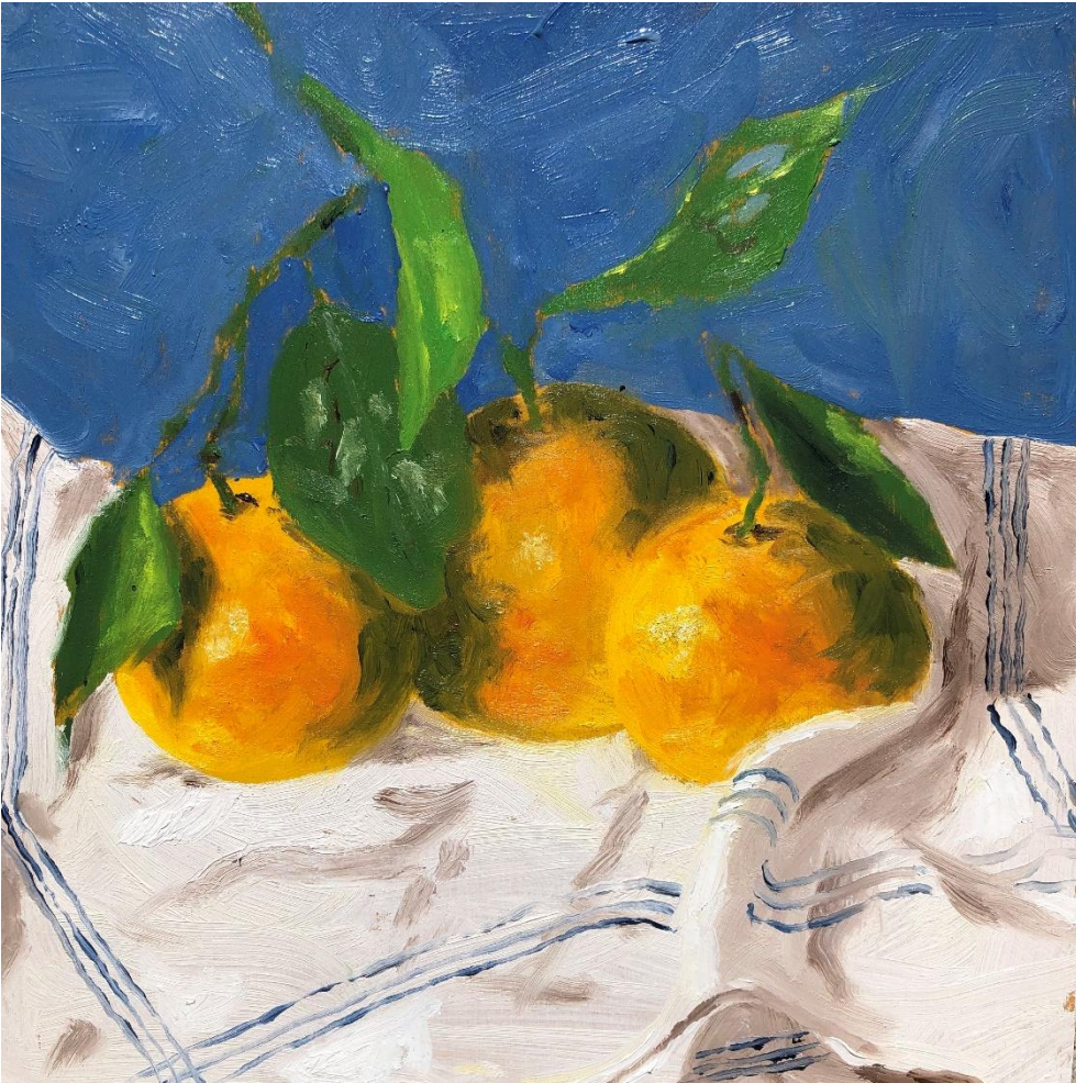
'Still life 11'; oil on board, 21x21cm, $650