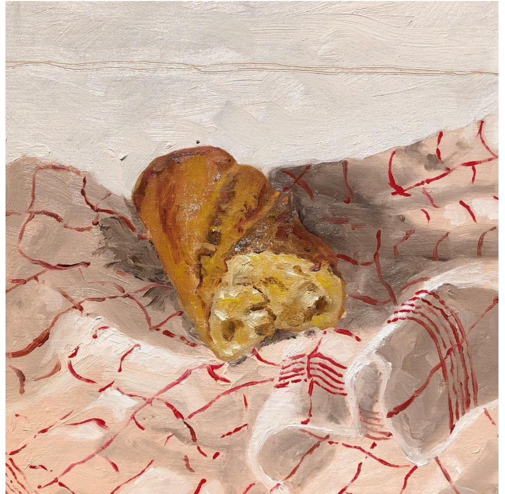
'Still life 8'; oil on board, 21x21cm, $650