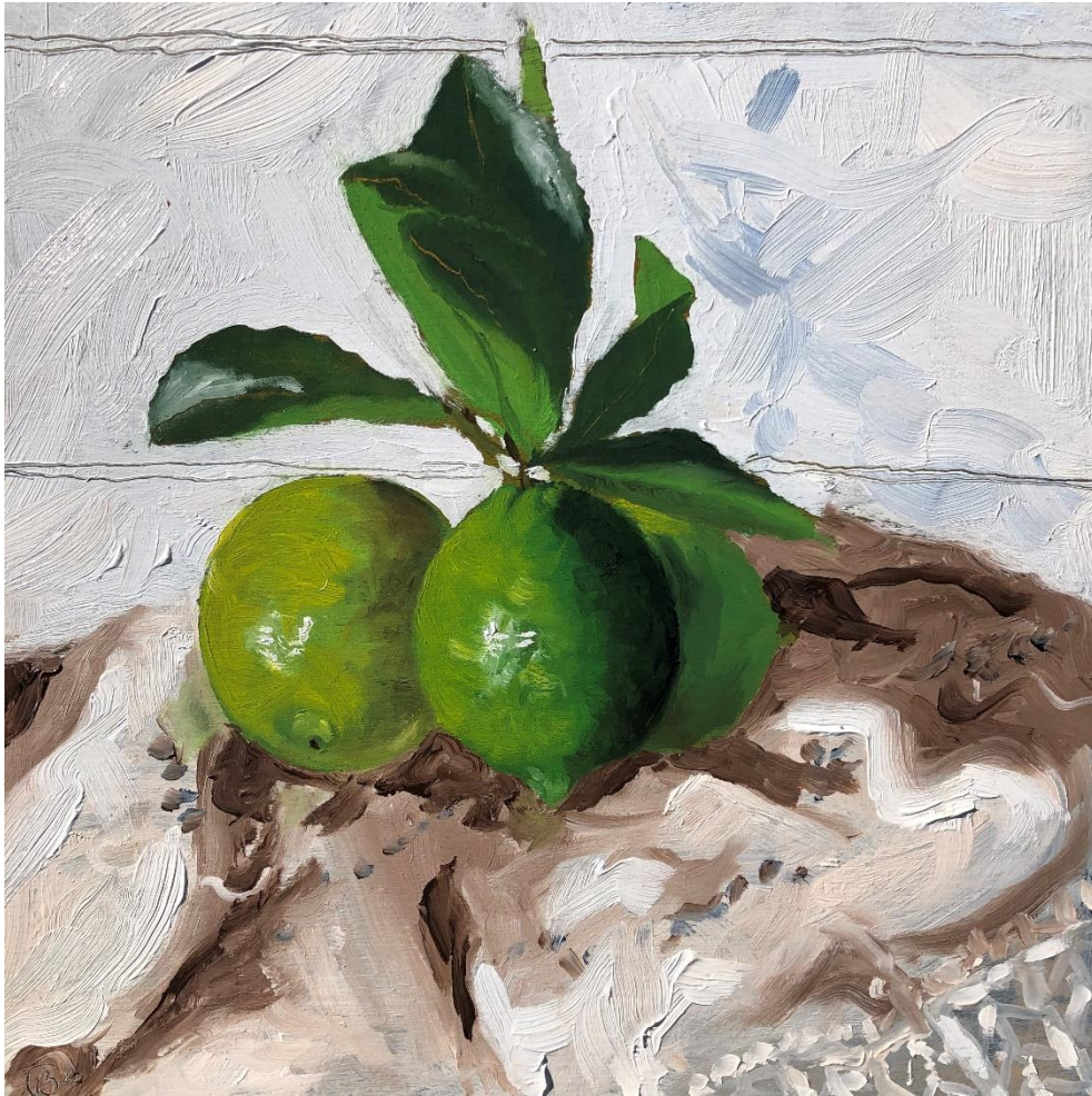
'3 limes'; oil on board, 21x21cm, $650