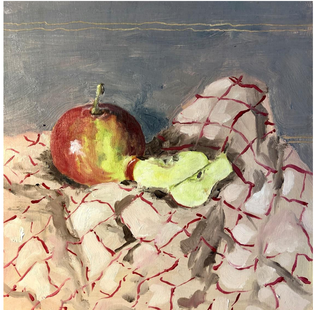
'Still life 10'; oil on board, 21x21cm, $650