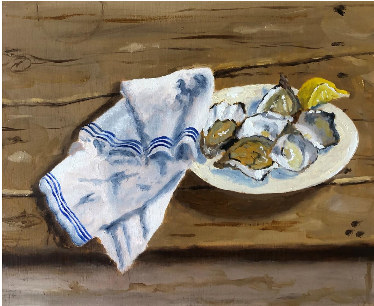
'Still life 2'; oil on board, 21x26cm, $750