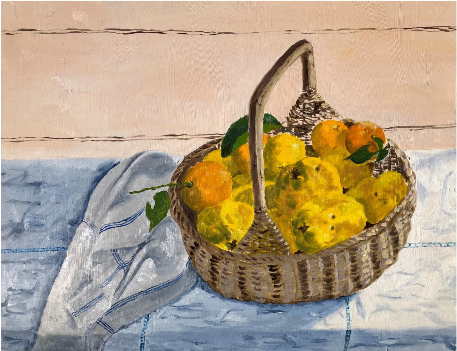
'Still life 1'; oil on board, 46x61cm, $1,290