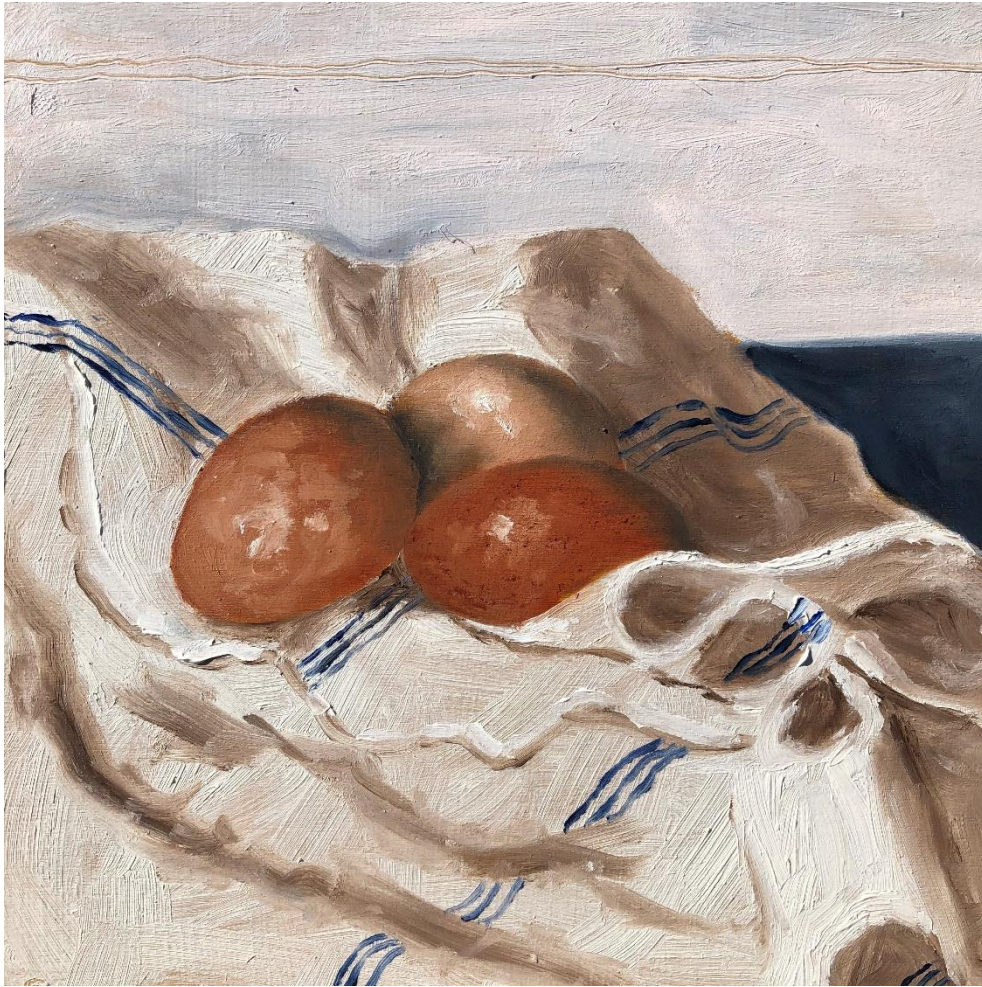
'Breakfast'; oil on board, 21x21cm, $650