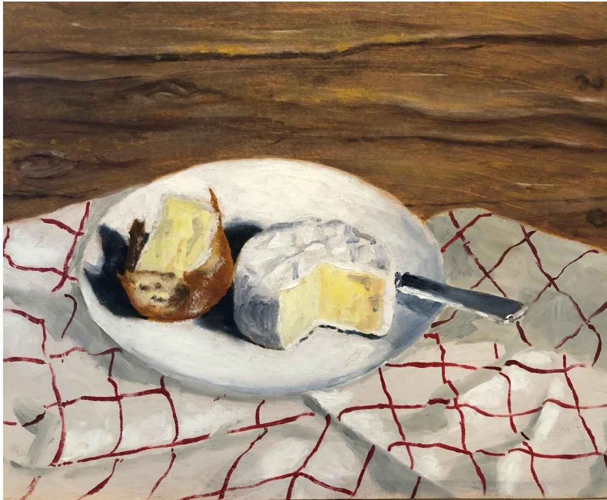
'Still life 6'; oil on board, 21x26cm, $750