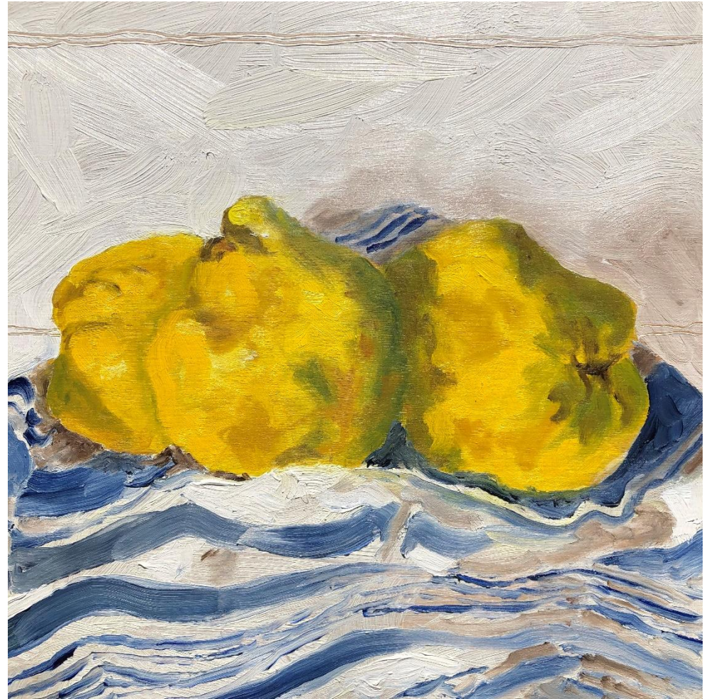
'Still life 12'; oil on board, 21x21cm, $650