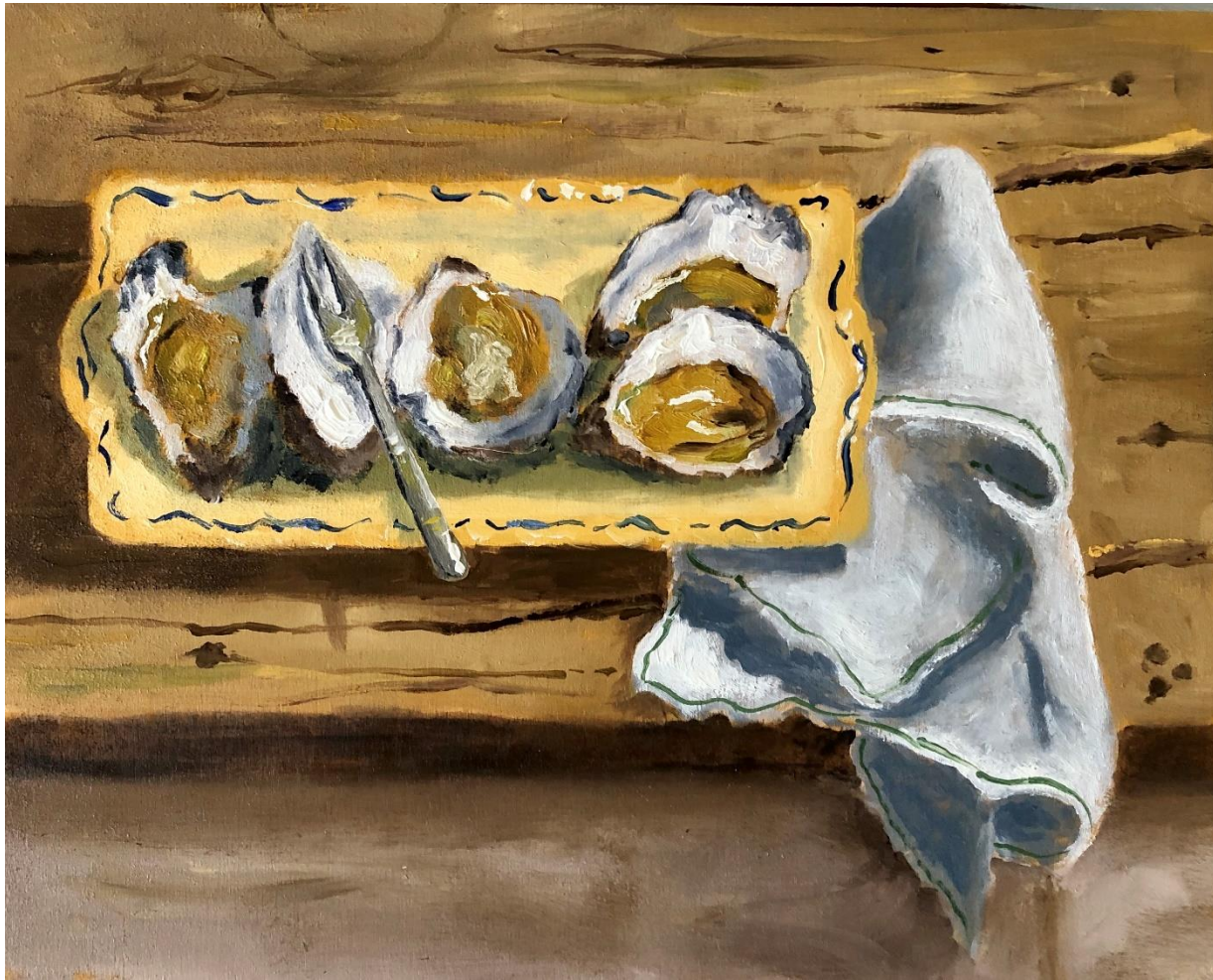
'Still life 3'; oil on board, 21x26cm, $750