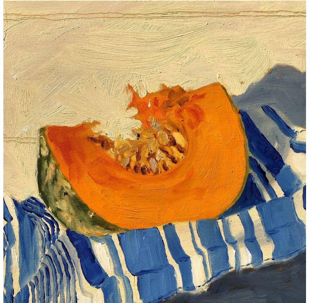
'Soup'; oil on board, 21x21cm, $650