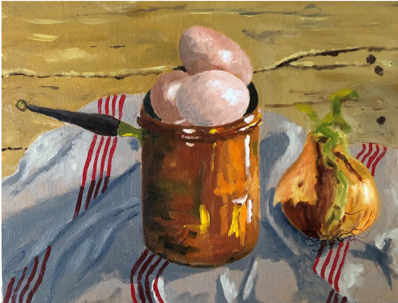
'Still life 4'; oil on board, 21x26cm , $750