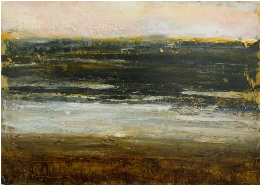
'Creek' 2021; oil on paper, 25x34cm, $690