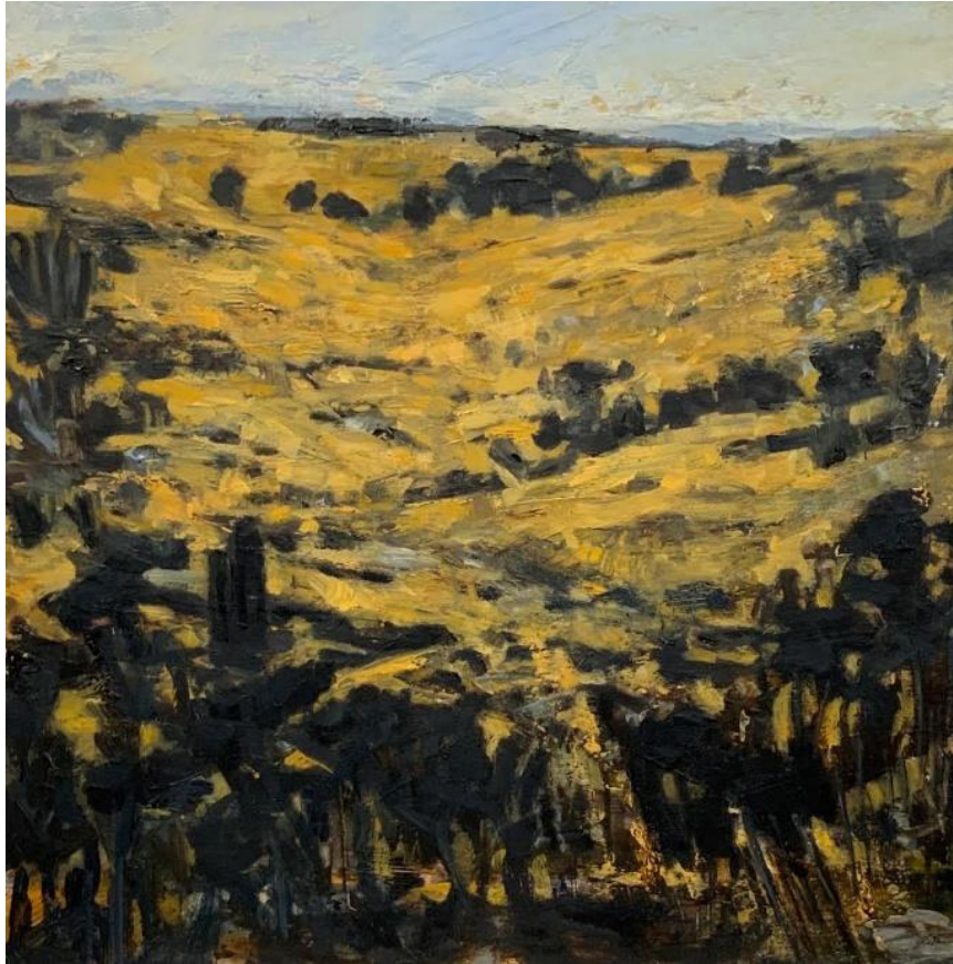
'Harry's Hill Autumn' 2021; oil on board, 30x30cm, $750