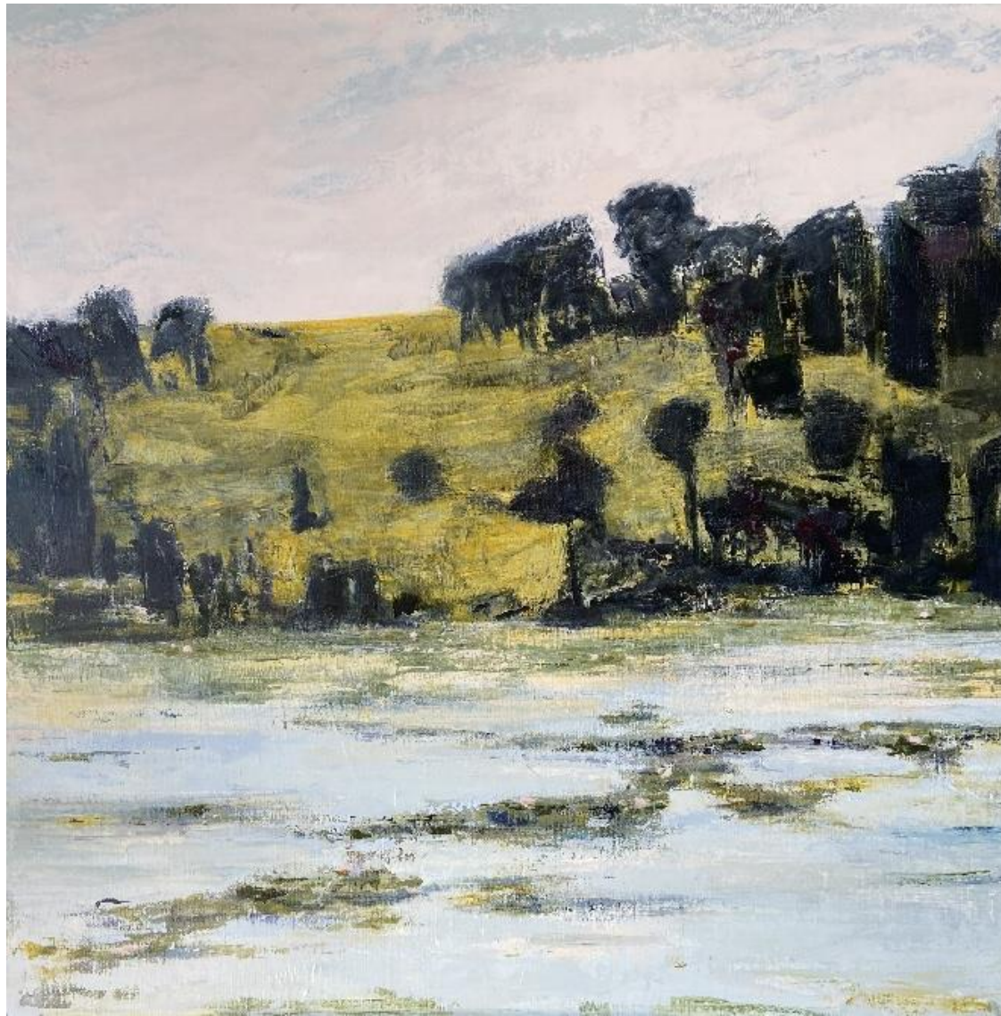
'Pink Lily Lagoon' 2021; oil on linen, 90x90cm, $2,500