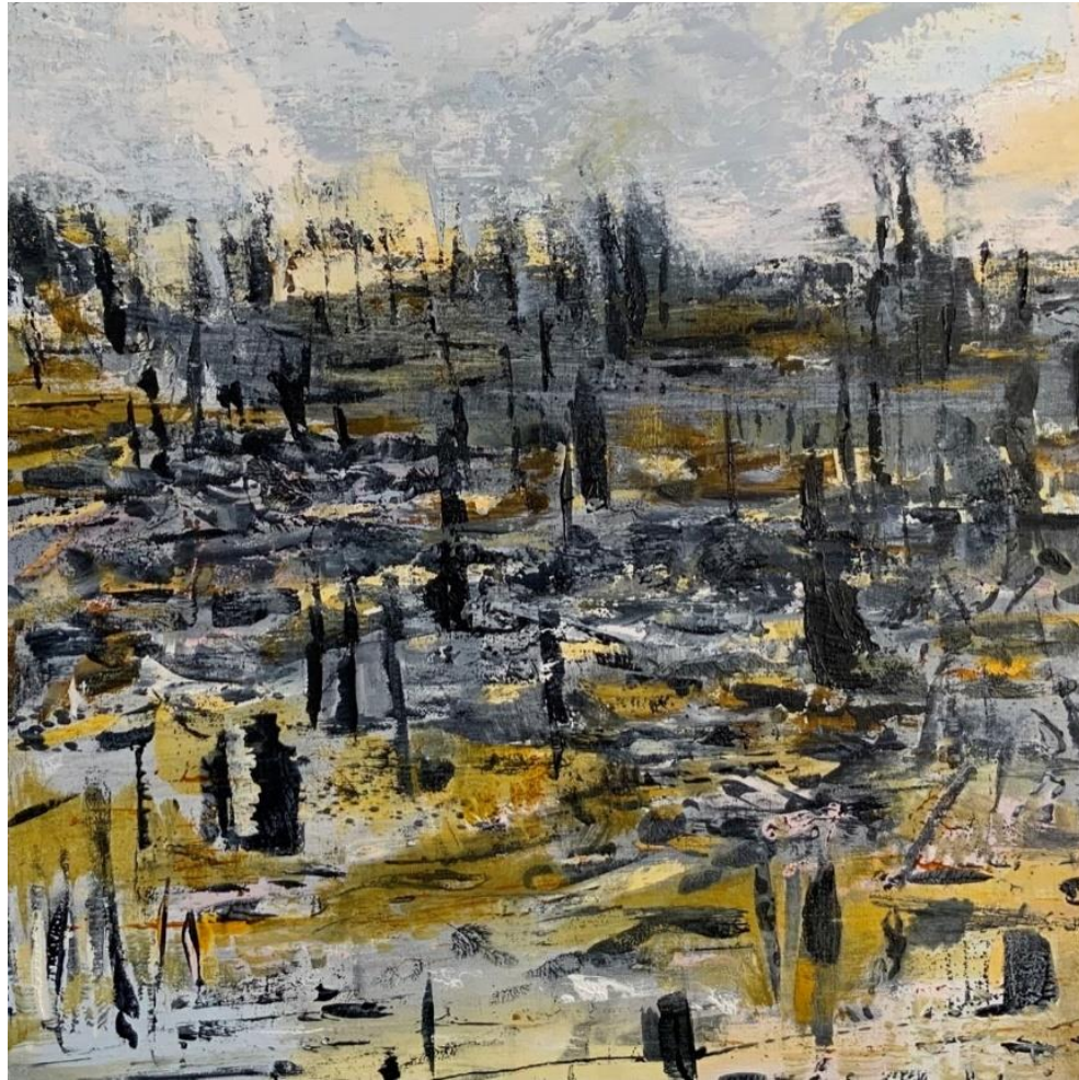
'Scorched' 2021; oil on linen, 60x60cm, $1,400