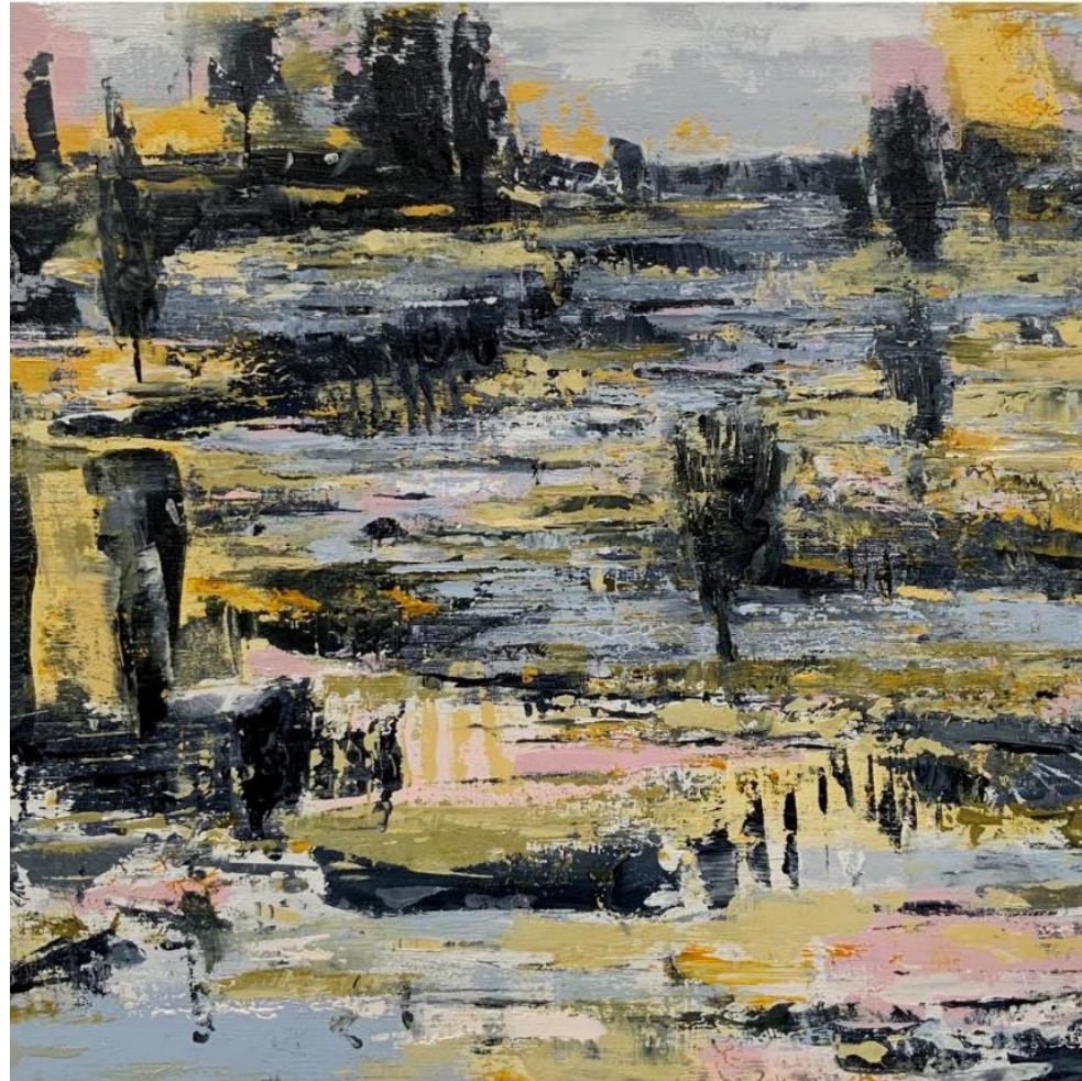
'Remnants and Renewal No.2' 2021; oil on linen, 60x60cm, $1,400