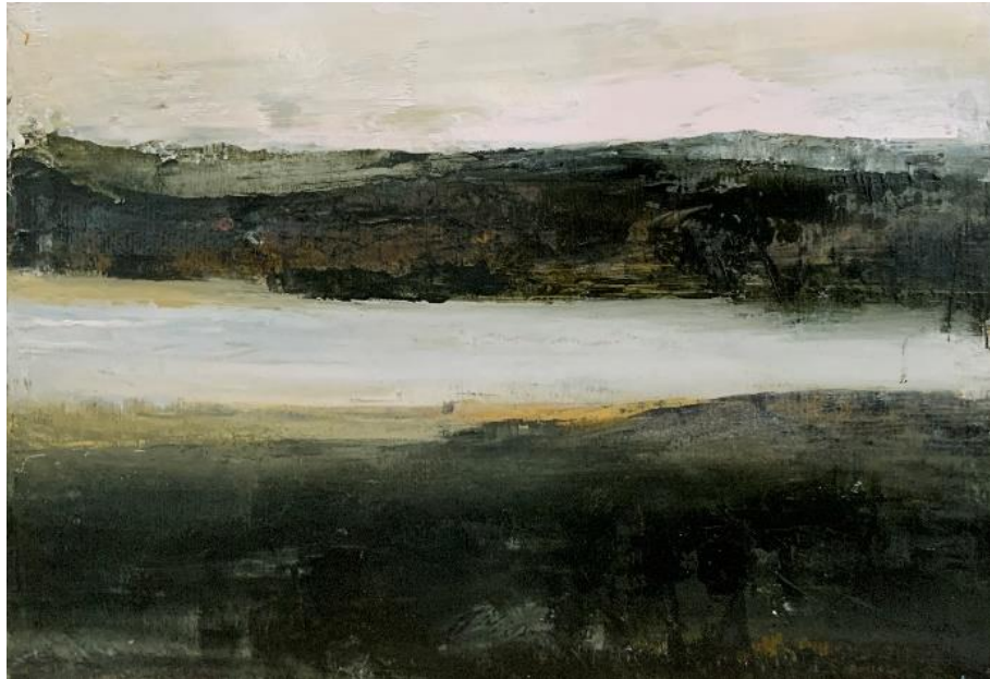
'River' 2021; oil on paper, 25x34cm, $690