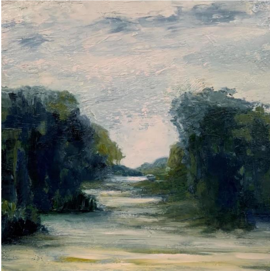
'Early Morning Light' 2021; oil on board, 30x30cm, $750