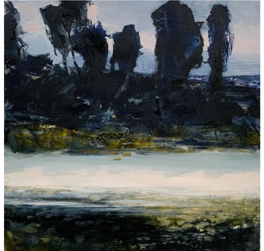
'Moonlit Pool' 2021; oil on board, 30x30cm, $750