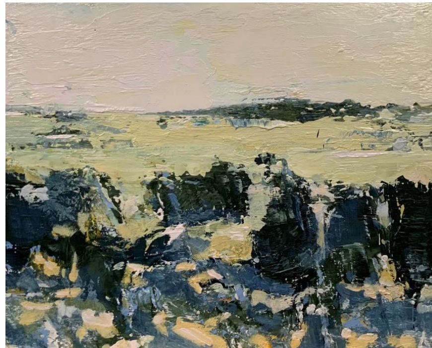
'Warm Winter Glow' 2021; oil on board, 25x30cm, $690