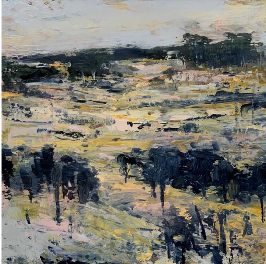
'Harry's Hill, Spring' 2021; oil on board, 30x30cm, $750