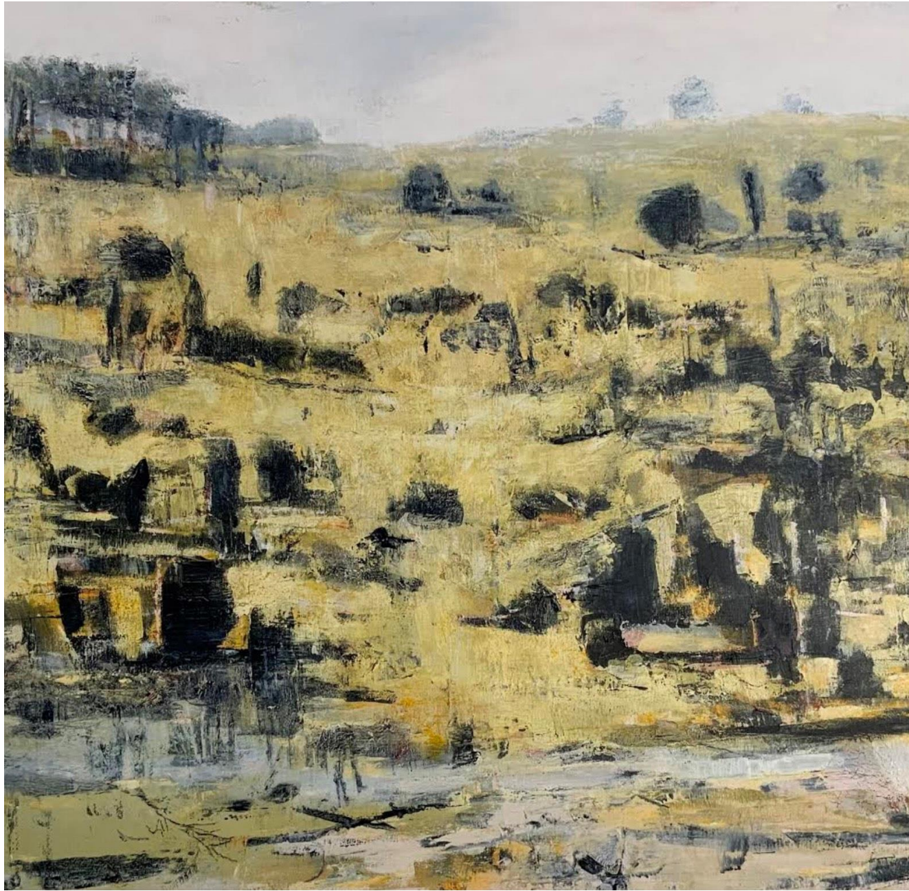
'Cloud Lifting' 2021; oil on linen, 120x120cm, $3,500