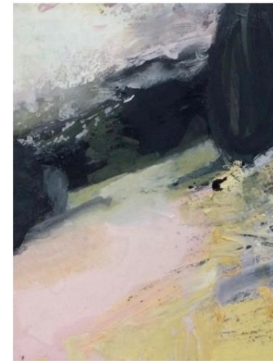
'Cascade of Colour' 2021; gouache on paper, 13x18cm, $590