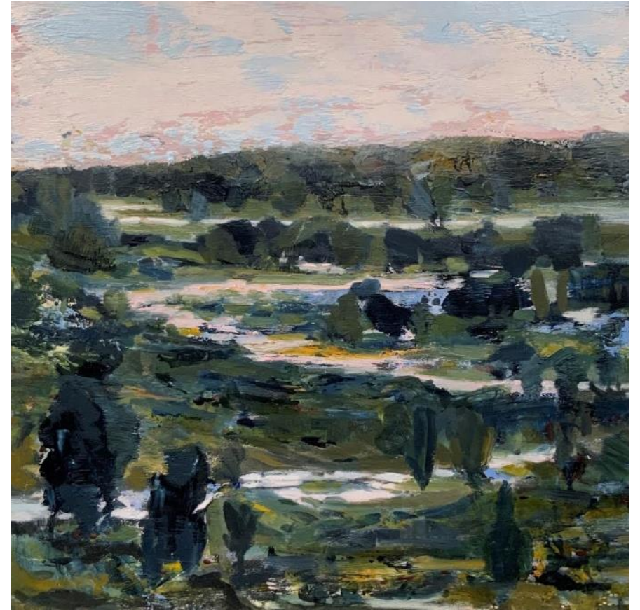
'Winding Creek' 2021; oil on board, 30x30cm, $750