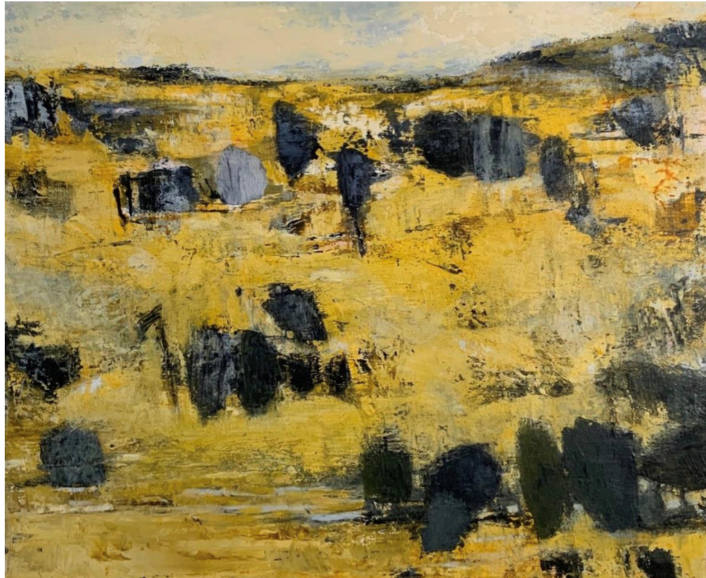
'Dry Creek' 2021; oil on linen, 50x60cm, $1,350