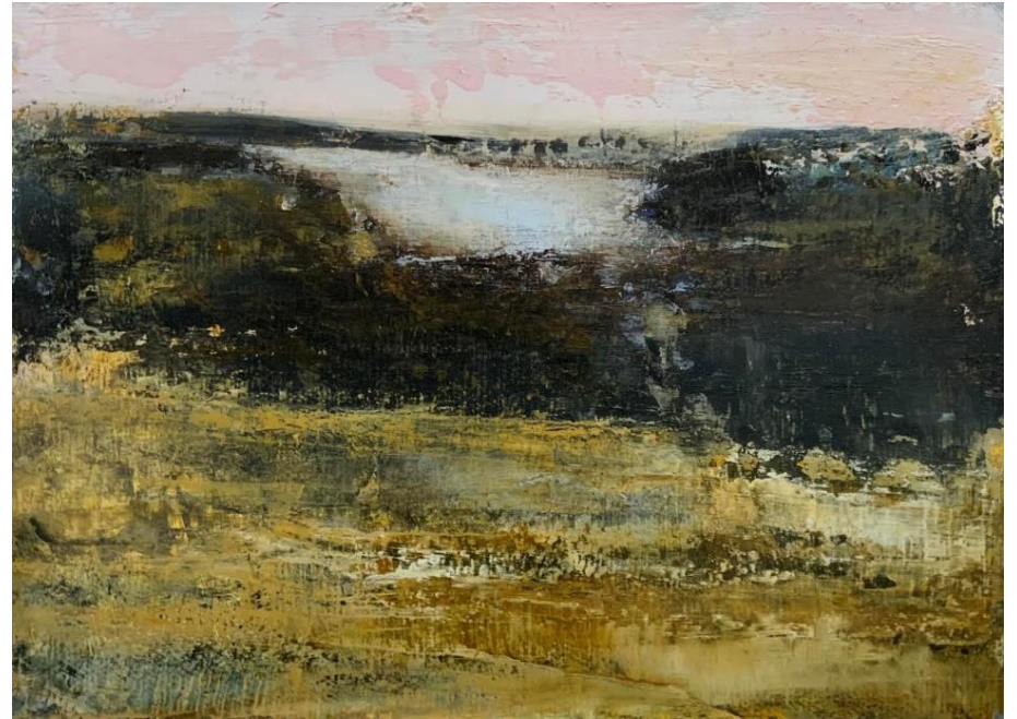
'Lagoon' 2021; oil on paper, 25x34cm, $690