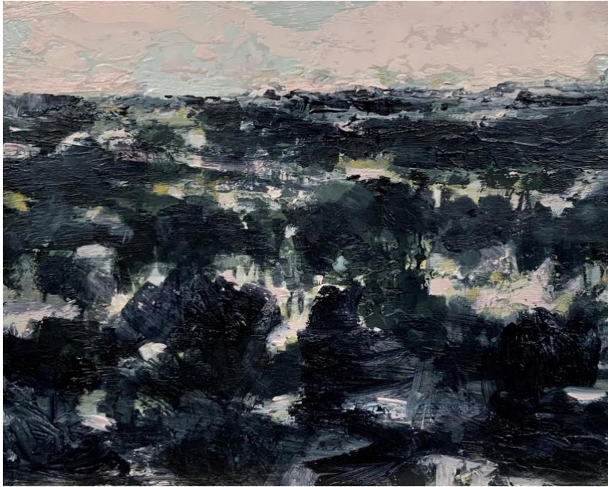
'Late Afternoon Shadows' 2021; oil on board, 25x30cm, $690