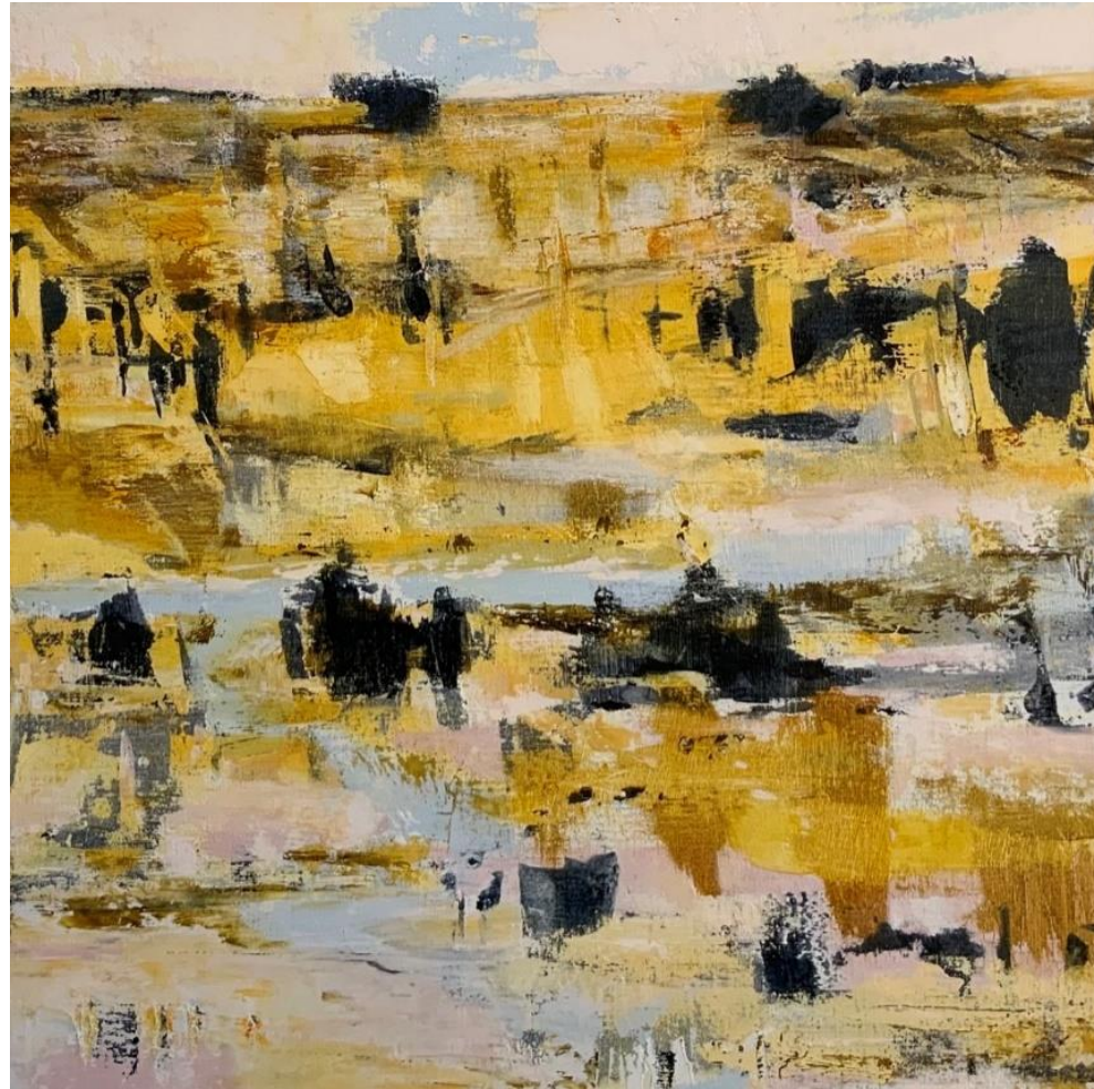
'Gully Running' 2021; oil on linen, 60x60cm, $1,400