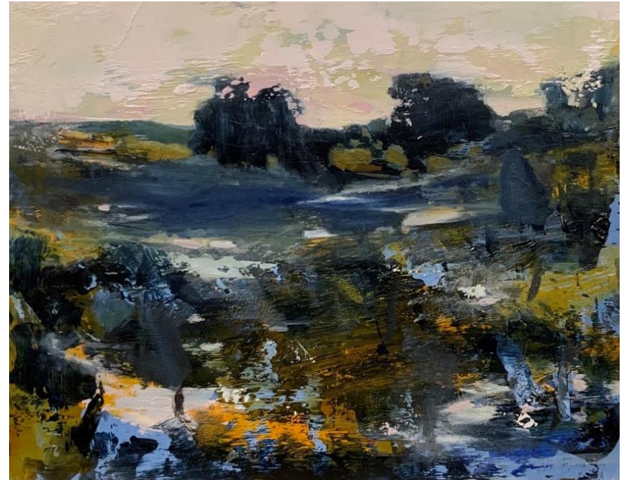
'Sunset Sky' 2021; oil on board, 25x30cm, $690