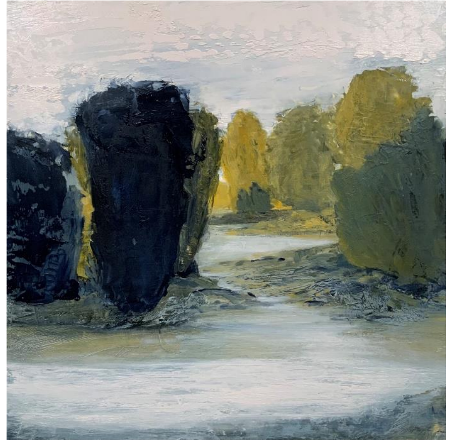
'Pool' 2021; oil on board, 30x30cm, $750