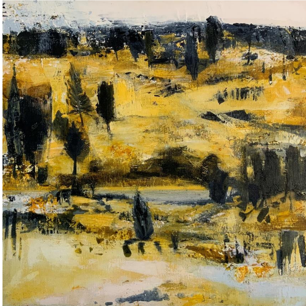
'Late Summer' 2021; oil on linen, 60x60cm, $1,400