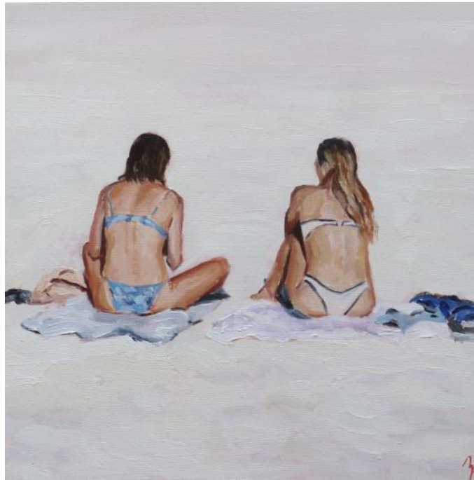
'Late Afternoon Sunbathers (Beach People No.8)' oil on cradled birch panel 20x20cm framed $490