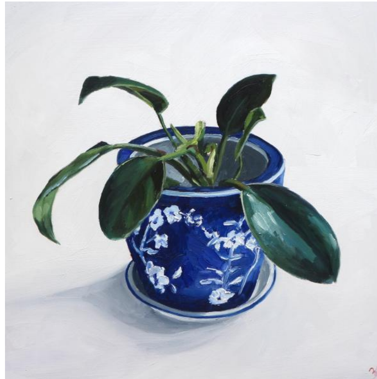
'Plant Portrait No.2' oil on cradled birch panel 30x30cm framed $750