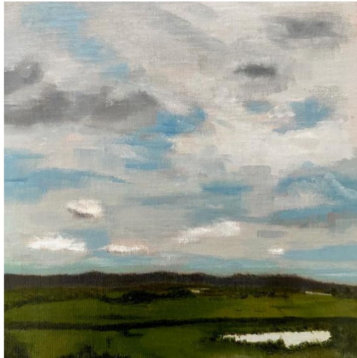
'Heading Home' oil on canvas panel 25.5x25.5cm framed $750