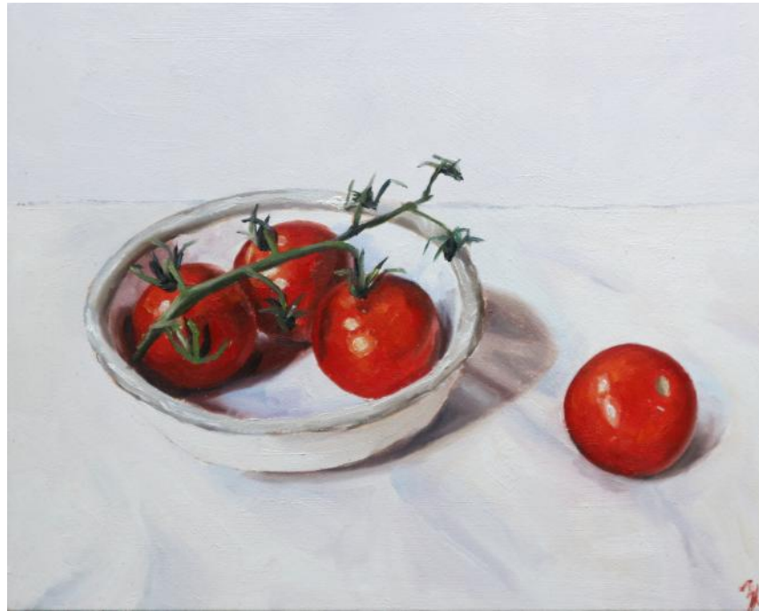
'Truss Tomatoes in Ceramic Bowl (No.2)' oil on cradled birch panel 20x25cm framed $550