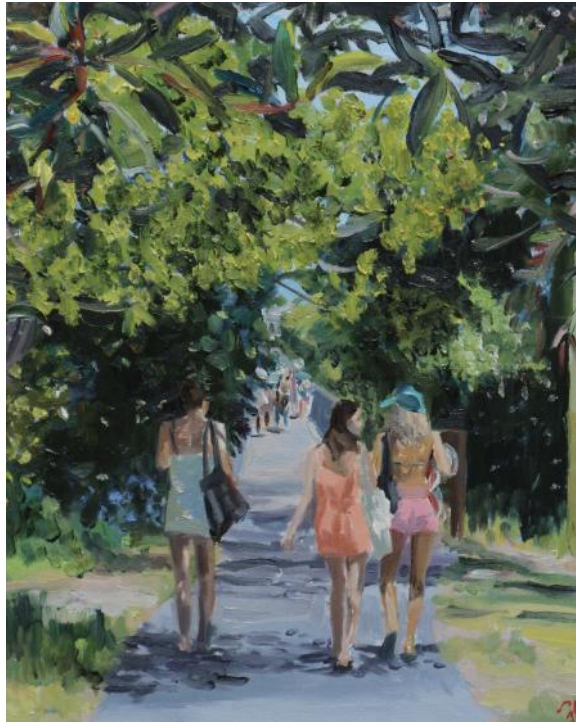
'Across the River (Brunswick Heads)' oil on linen panel 25x20cm framed $550