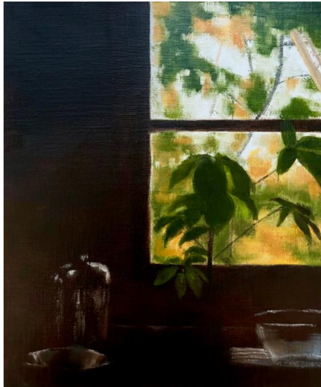
'Kitchen Window' oil on canvas board 30.5x25.5cm framed $790