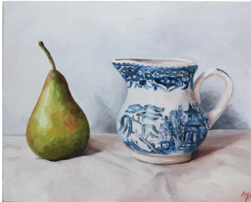
'Pear and Chinoiserie Jug' oil on cradled birch panel 20x25cm framed $550