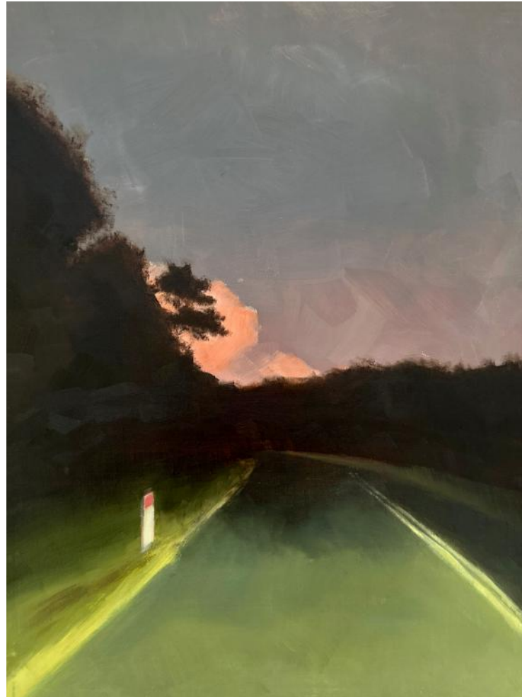
'Night Driving IV' oil on canvas panel 40.6x30.5cm framed $990