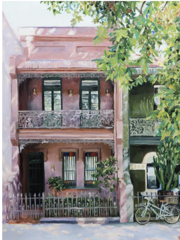
'Dappled Summer Light (Sydney Terrace No.1)' oil on cradled birch panel 40x30cm framed $1,390