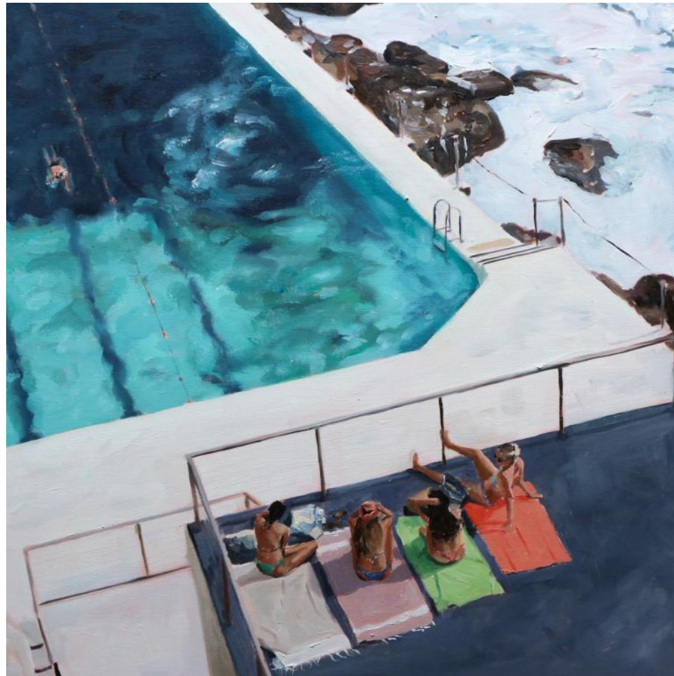
'The Sunbathers (Ocean Pool No.2)' oil on cradled birch panel 40x40cm framed $1,490