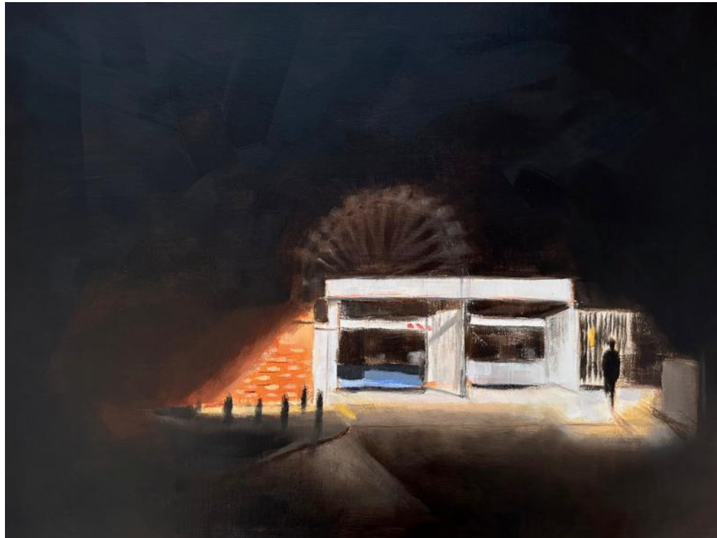
'North Sydney Evening' oil on canvas panel 30.5x40.6cm framed $990