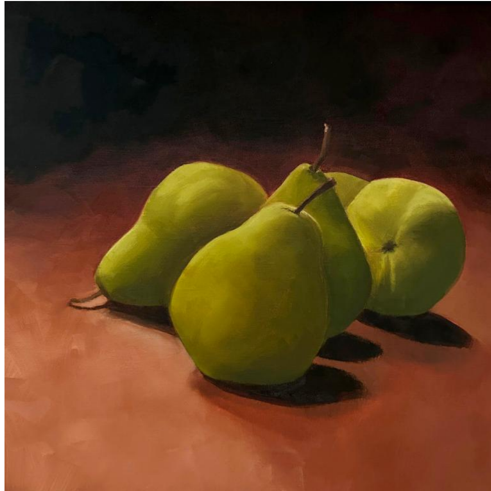
'Packham Pears' oil on linen 40x40cm framed $1,290