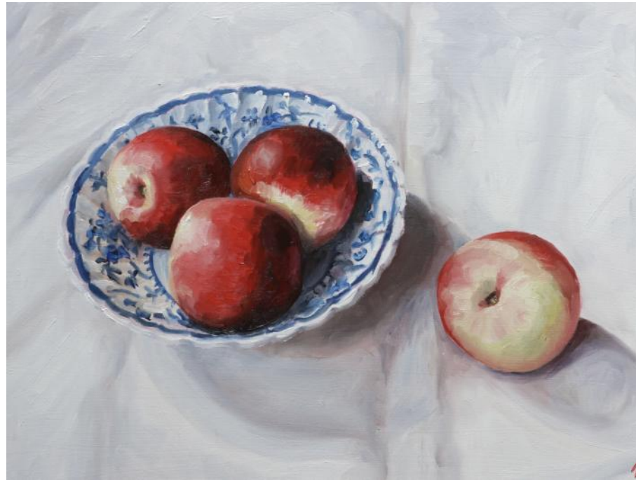
'Nectarines in Chinoiserie Bowl' oil on cradled birch panel 22.8x30.5cm framed $690