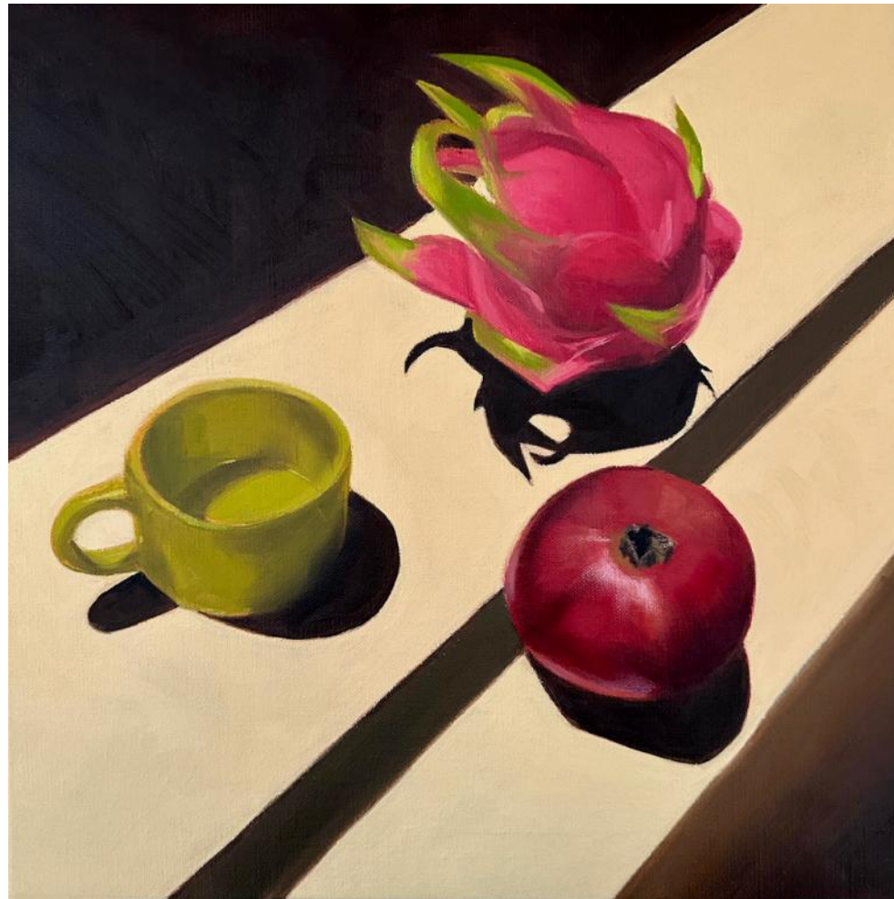
'Dragonfruit, Pomegranate with Espresso Mug' oil on Belgium linen 41x41cm framed $1,290