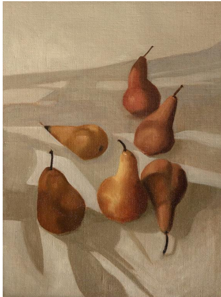
'Pears on Linen' oil on linen board 40.6x30.5cm framed $990