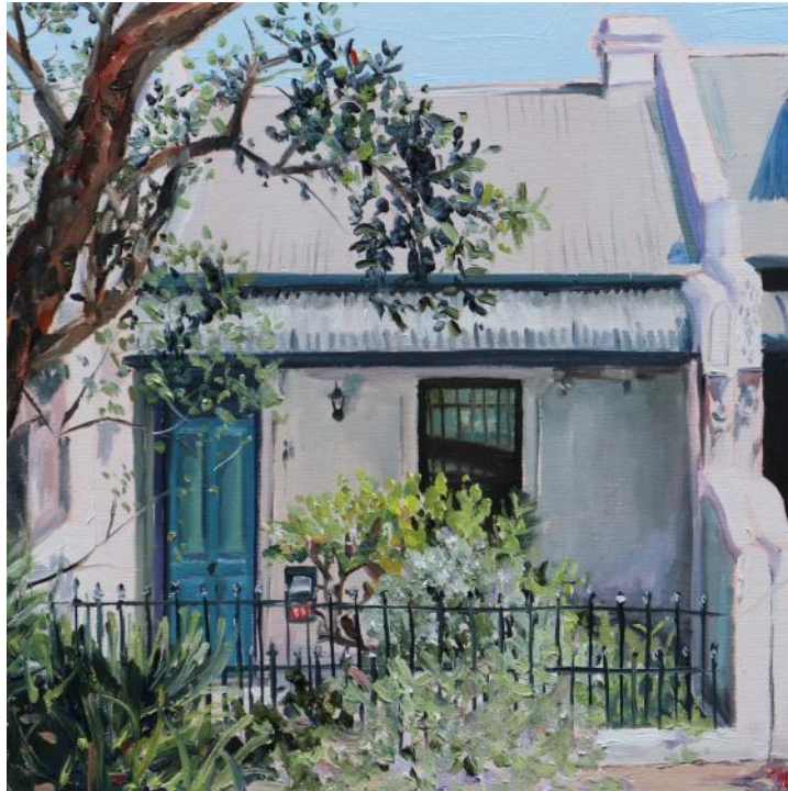
'House with the Blue Door (Sydney Terrace No.2)' oil on linen panel 25x25cm framed $650