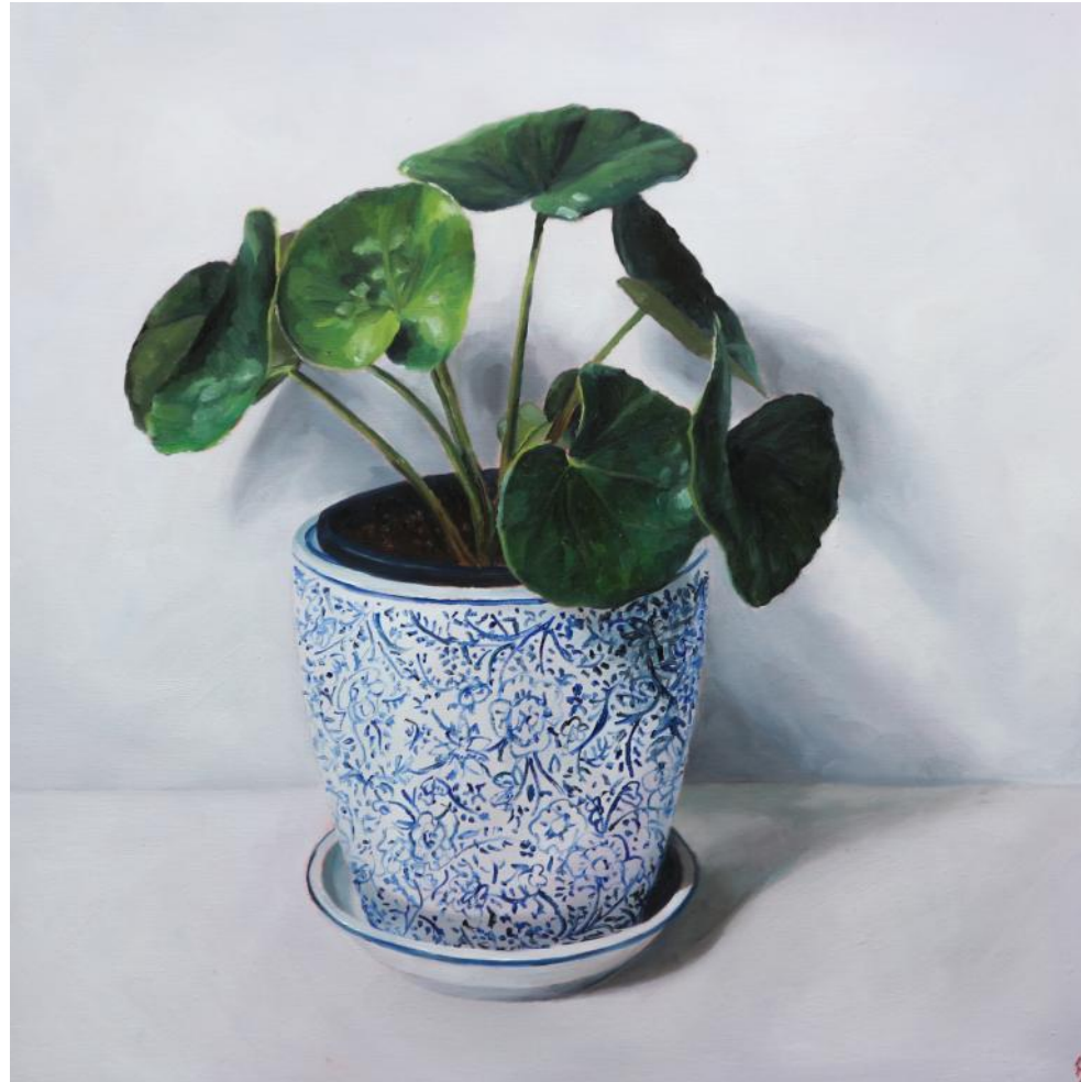
'Plant Portrait No.4' oil on cradled birch panel 40x40cm framed $1,490