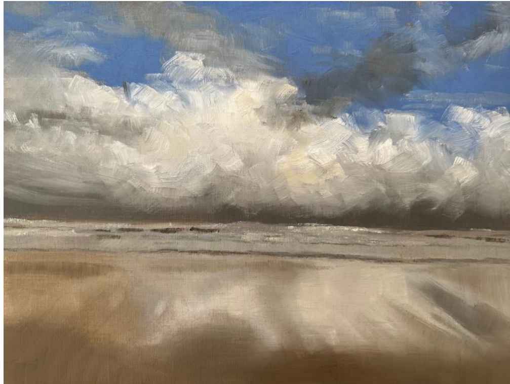
'Cabarita Beach Reflections I' oil on canvas panel 30.5x40.6cm framed $990