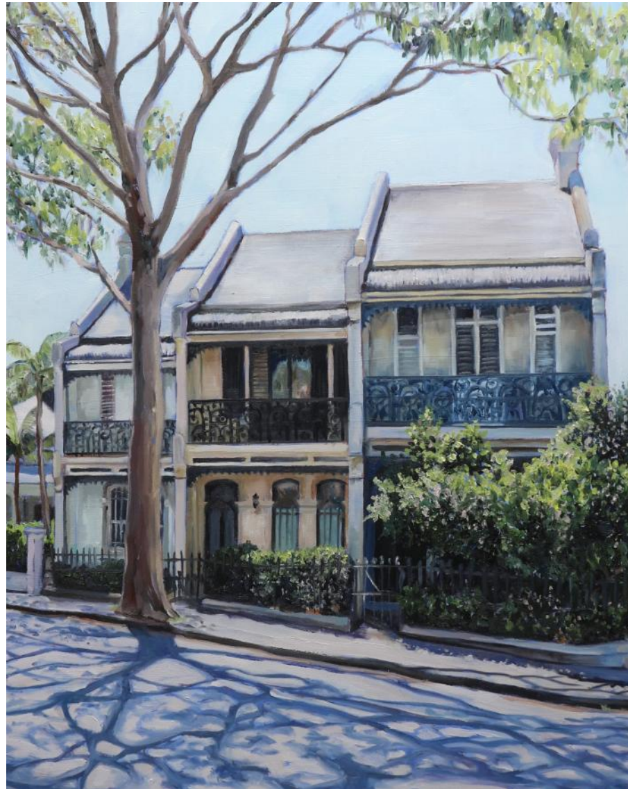
'Under the Gumtree (Sydney Terrace No.3)' oil on cradled birch panel 50x40cm framed $1,590