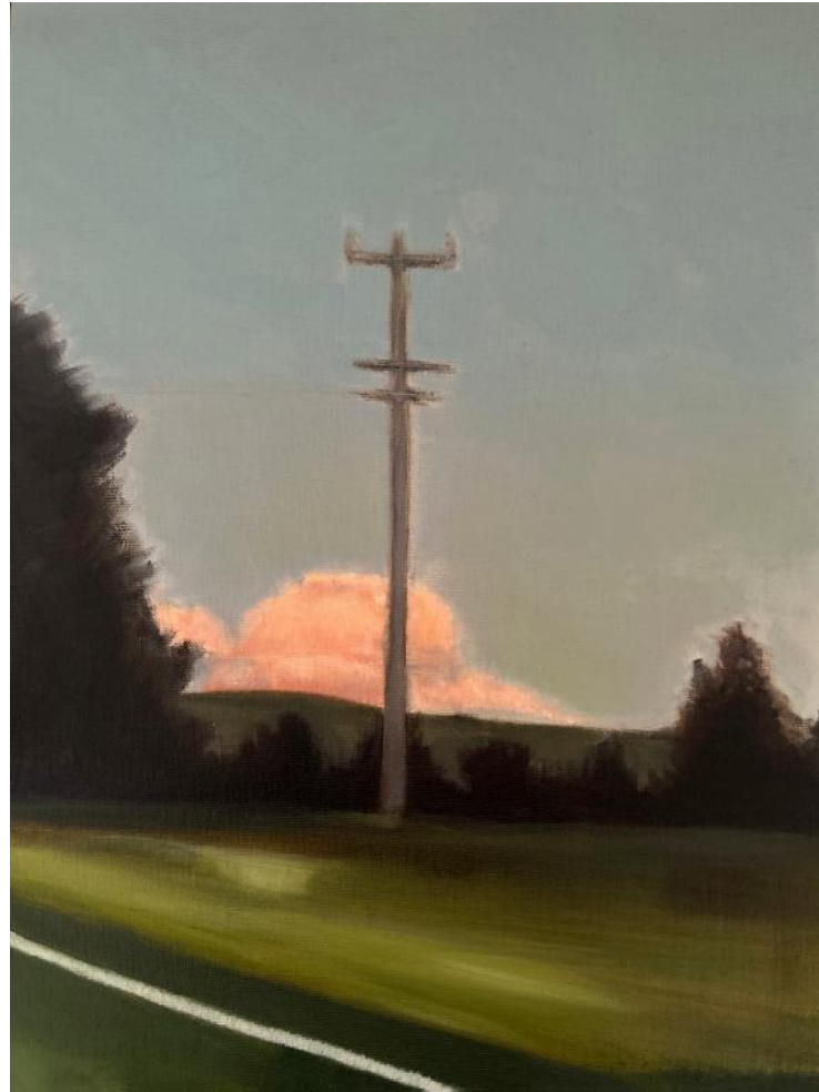
'Night Driving II' oil on canvas panel 40.6x30.5cm framed $990