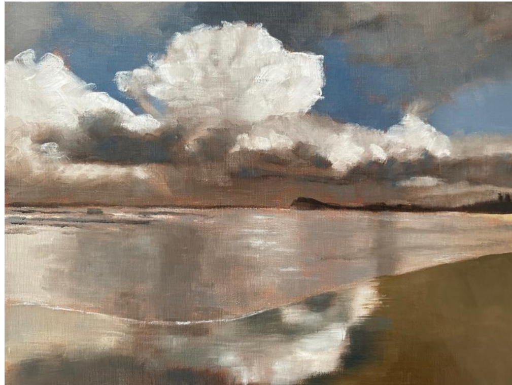
'Cabarita Beach Reflections II' oil on Canvas panel 30.5x40.6cm framed $990