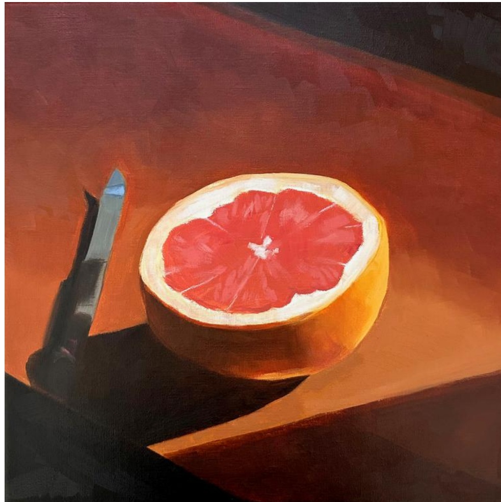
'Grapefruit Half' oil on linen 40x40cm framed $1,290