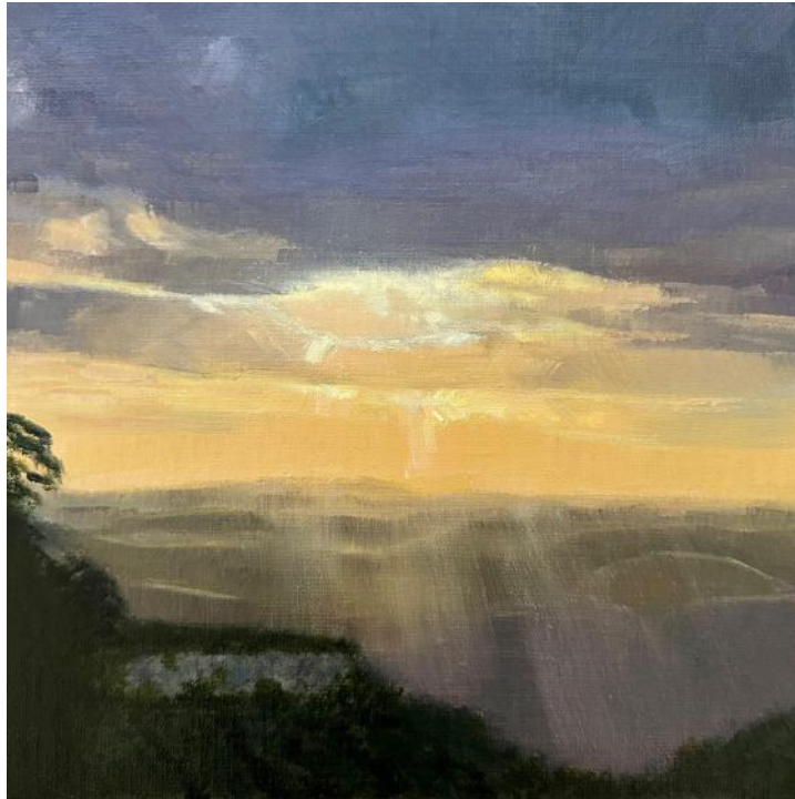
'Breaking Through' oil on canvas panel 25.5x25.5cm framed $750