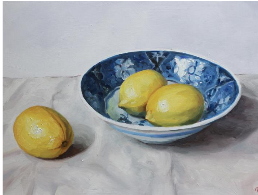
'Lemons in Chinoiserie Bowl (No.2)' oil on cradled birch panel 22.8x30.5cm framed $690