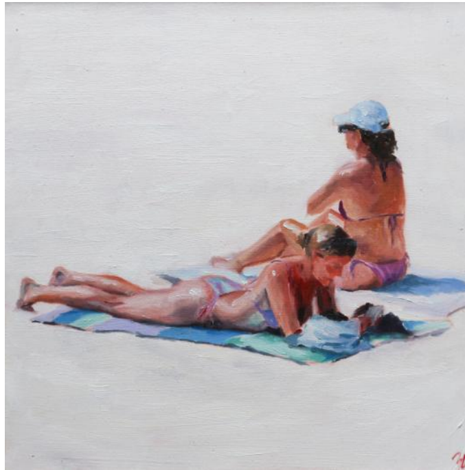
'Beach People No.9' oil on cradled birch panel 20x20cm framed $490