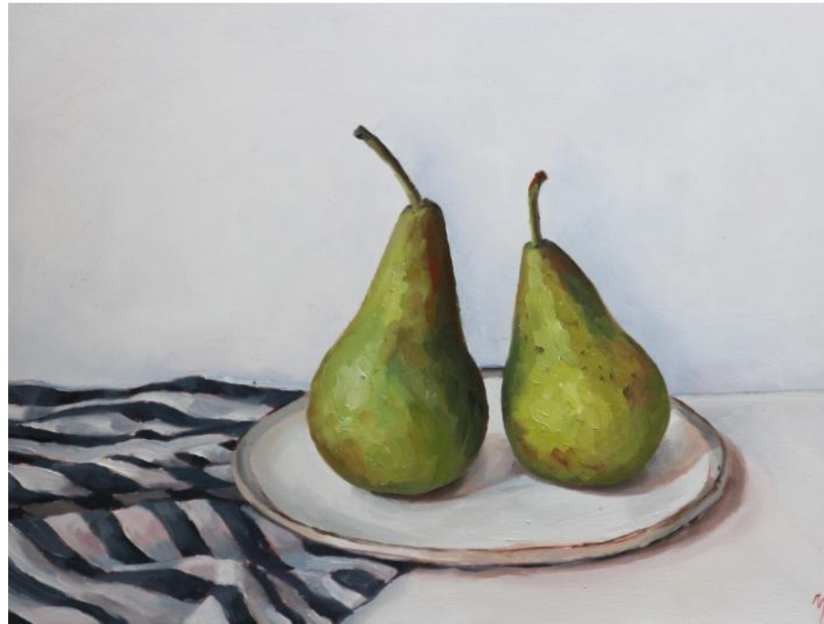
'Pears on Ceramic Plate' oil on cradled birch panel 22.8x30.5cm framed $650