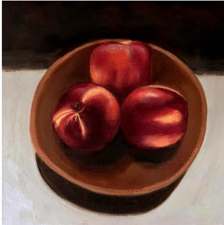
'Nectarines in Bowl' oil on Belgium linen 25.5x25.5cm framed $750