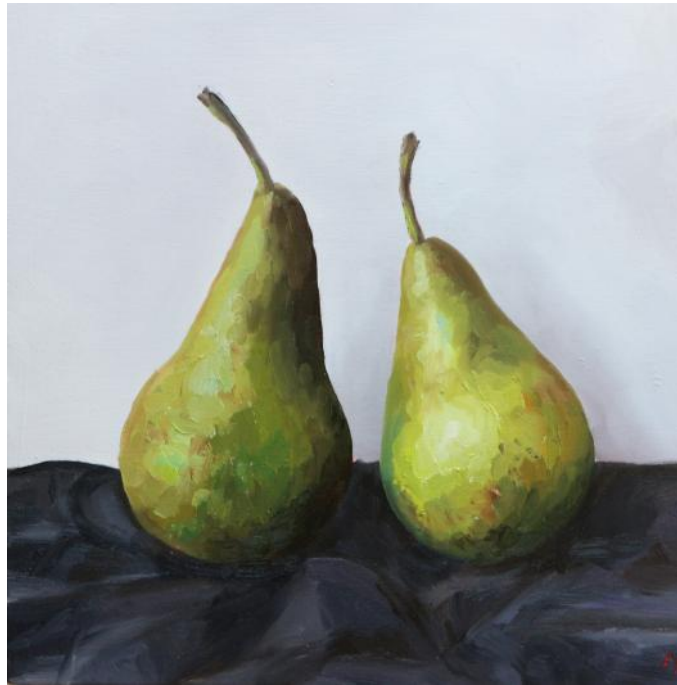
'Pears on Charcoal Cloth' oil on cradled birch panel 20x20cm framed $490