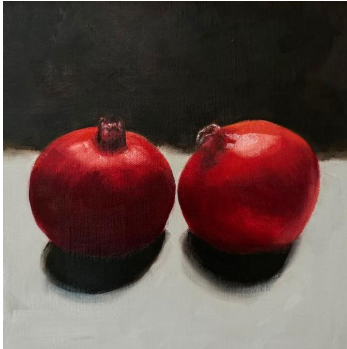
'Pomegranates on Linen' oil on Belgium linen 25.5x25.5cm framed $750