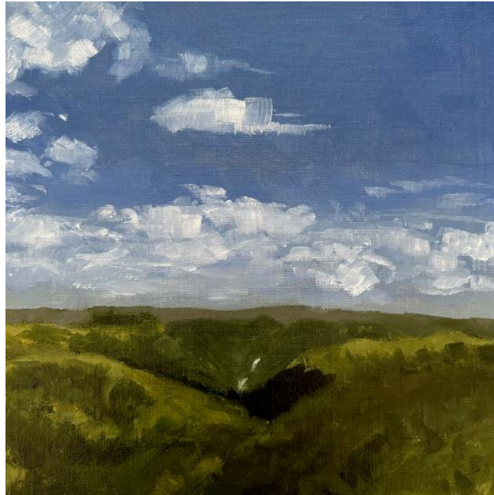
'Another Day at the Ridge' oil on canvas panel 25.5x25.5cm framed $750