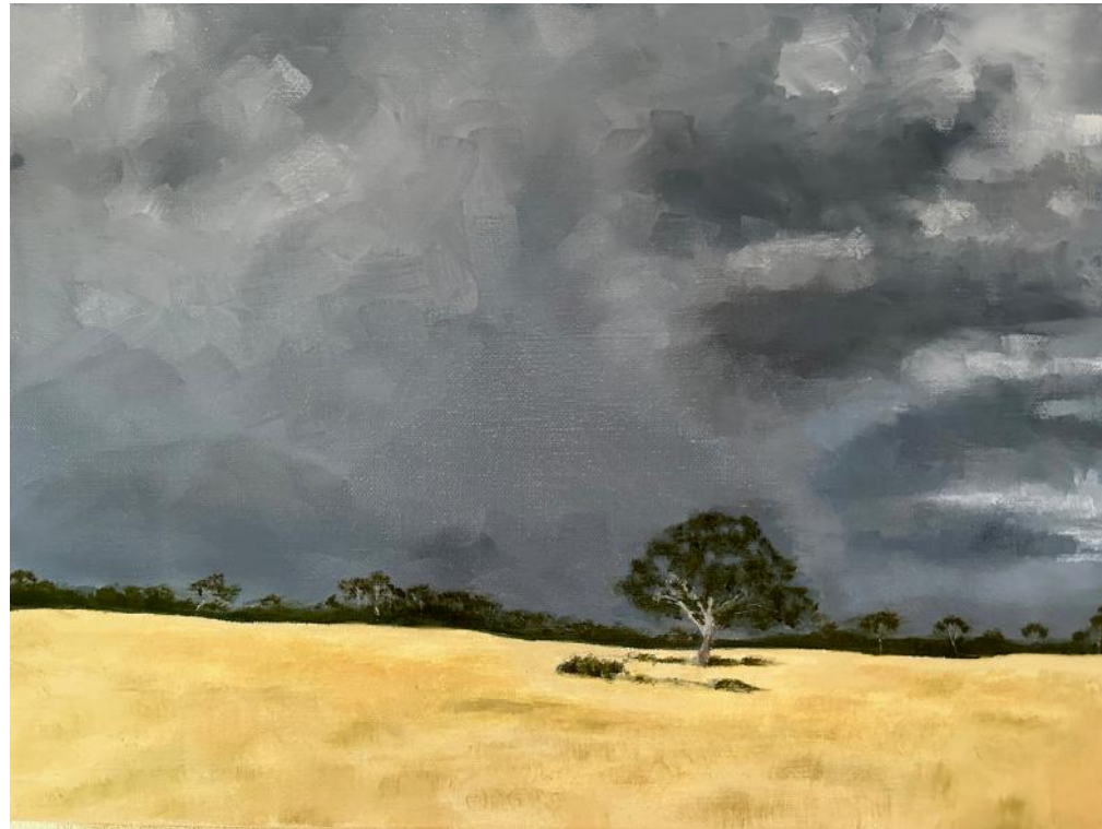
'Racing Clouds Bombay' oil on Belgium linen 30.5x40.6cm framed $990