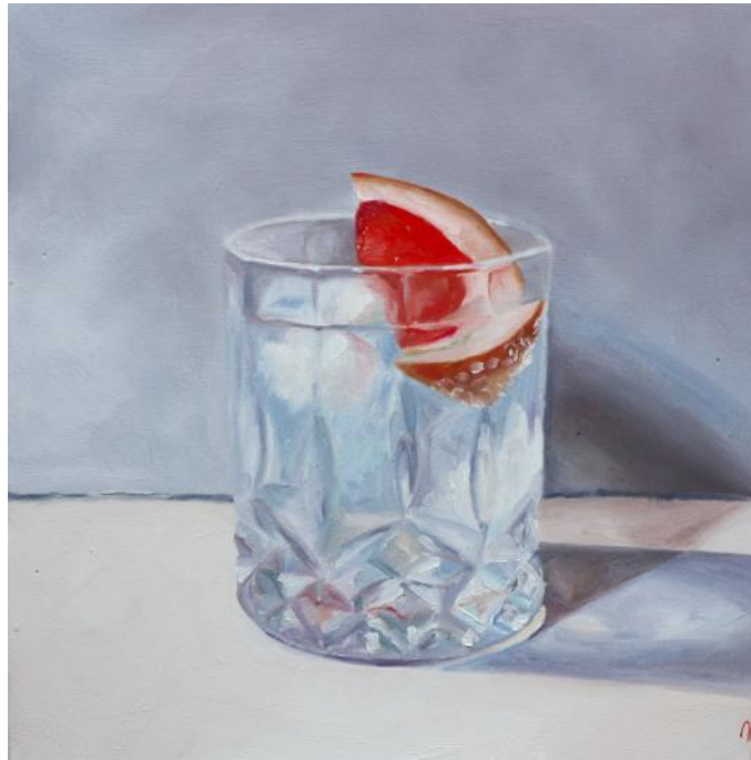
'Gin and Tonic (No.2)' oil on cradled birch panel 20x20cm framed $490