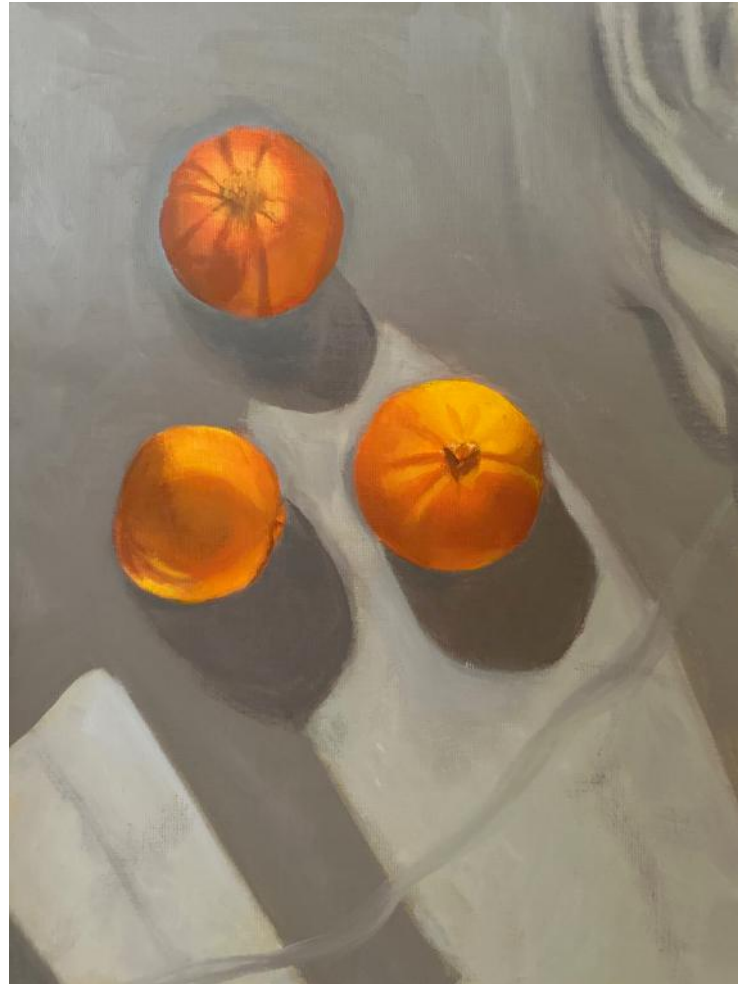
'Mandarins on Linen' oil on linen board 40.6x30.5cm framed $990