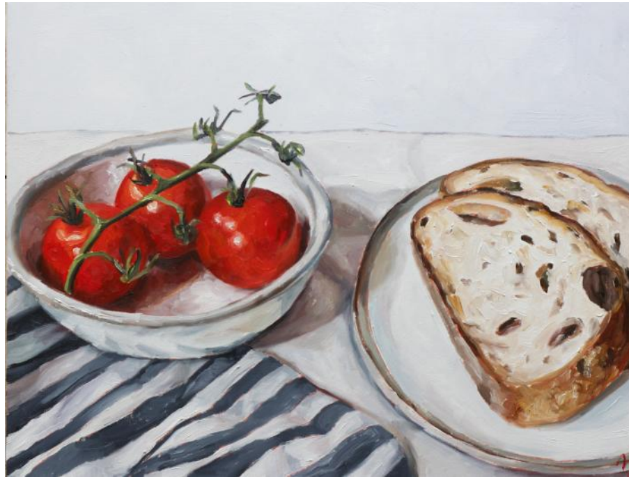
'Olive Bread and Truss Tomatoes' oil on cradled birch panel 22.8x30.5cm framed $650