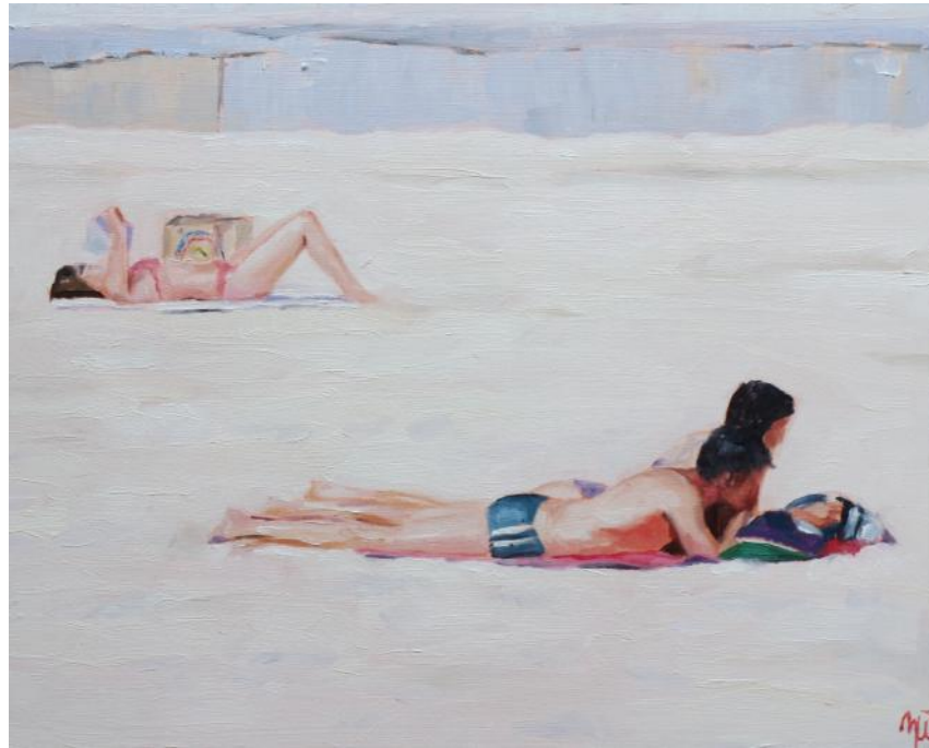
'Tamarama Bathers (Beach People No.10)' oil on cradled birch panel 20x25cm framed $550