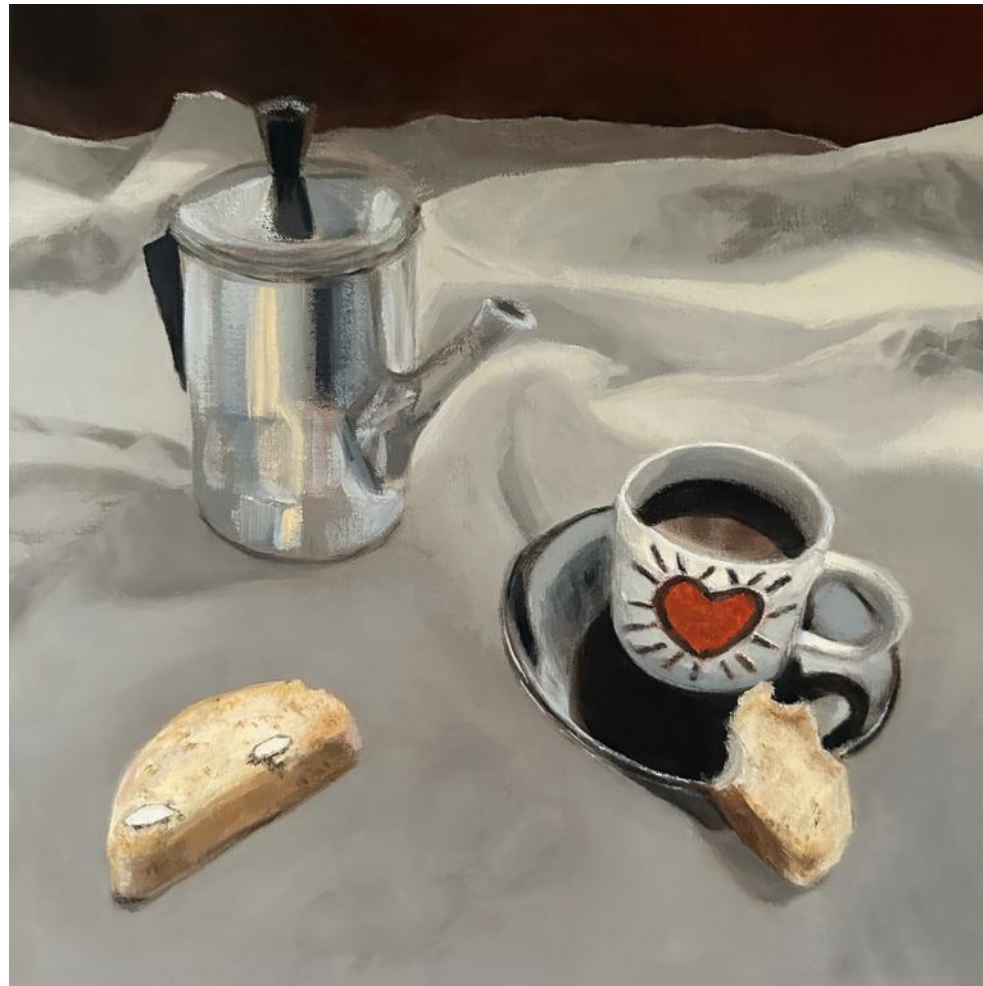
'Love Espresso with Biscotti' oil on Belgium linen 41x41cm framed $1,290