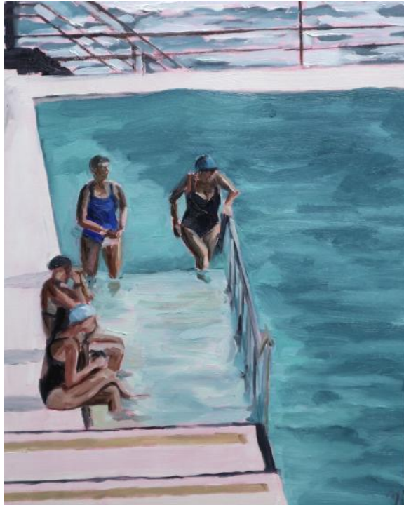
'The Swimmers (Ocean Pool No.1)' oil on cradled birch panel 25x20cm framed $550