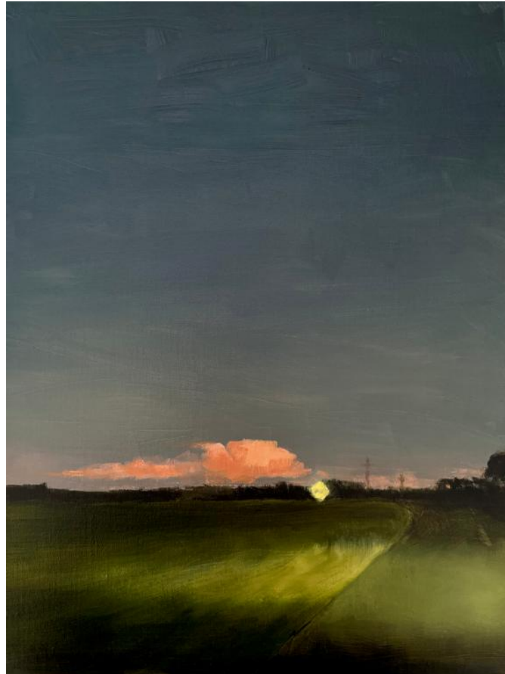
'Night Driving III' oil on canvas panel 40.6x30.5cm framed $990