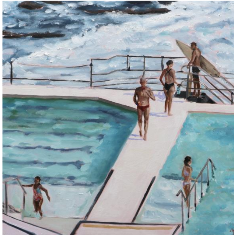
'Bondi Morning (Ocean Pool No.3)' oil on cradled birch panel 30x30cm framed $750