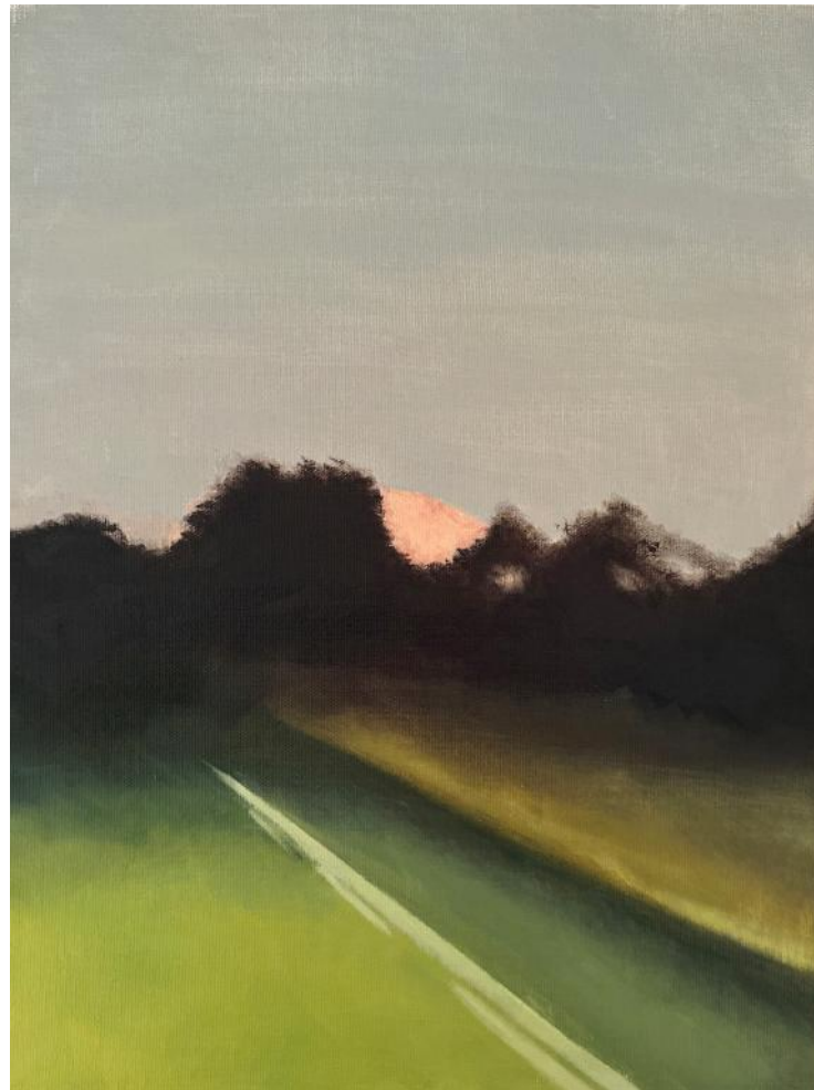
'Night Driving I' oil on canvas panel 40.6x30.5cm framed $990