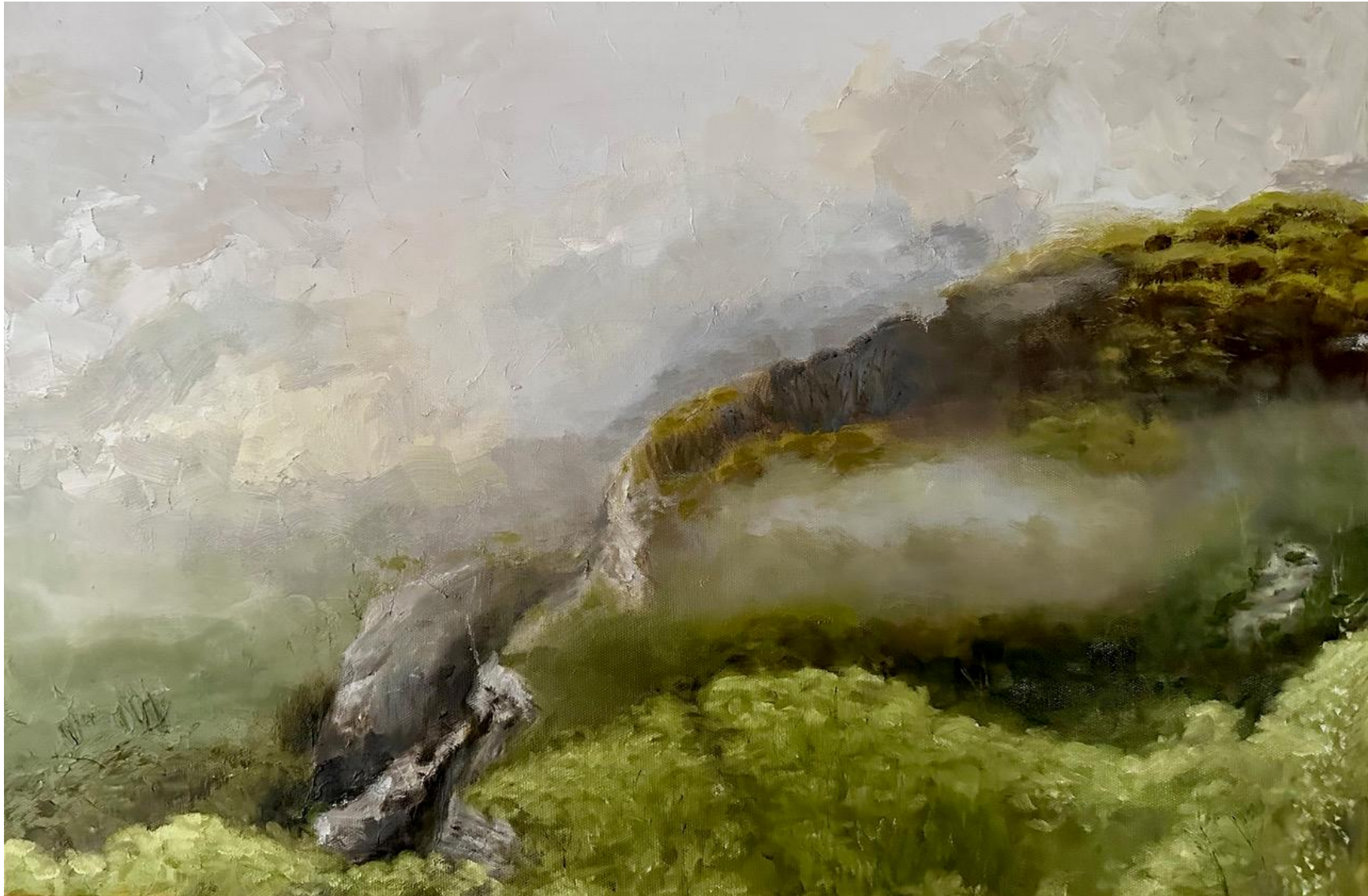
'Neighbouring Guula Ngurra' oil on canvas 50.5x76cm framed $1,690