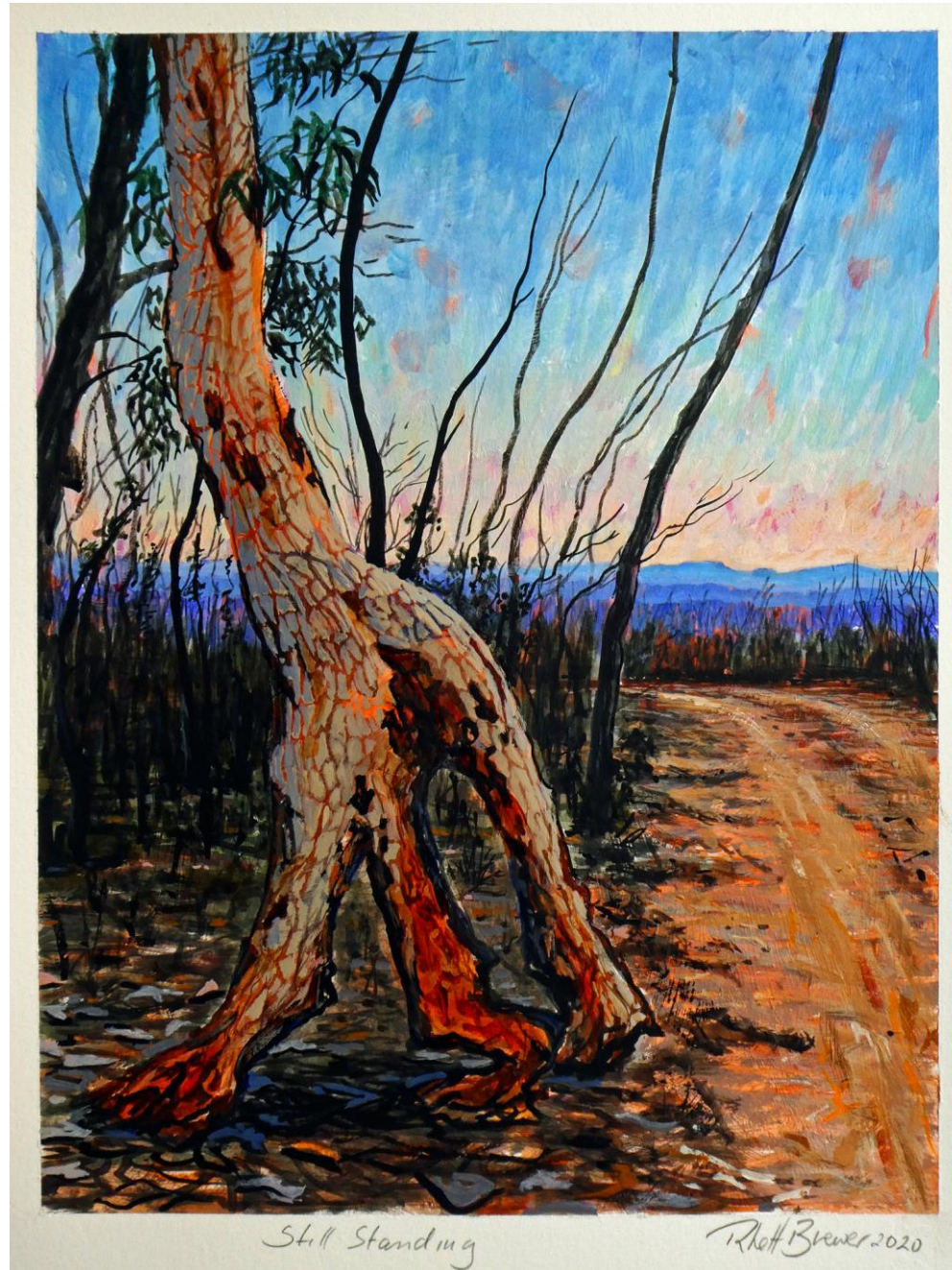
'Still Standing' 2020; acrylic on 640 g.s.m. watercolour paper, 33.9x28cm, $850