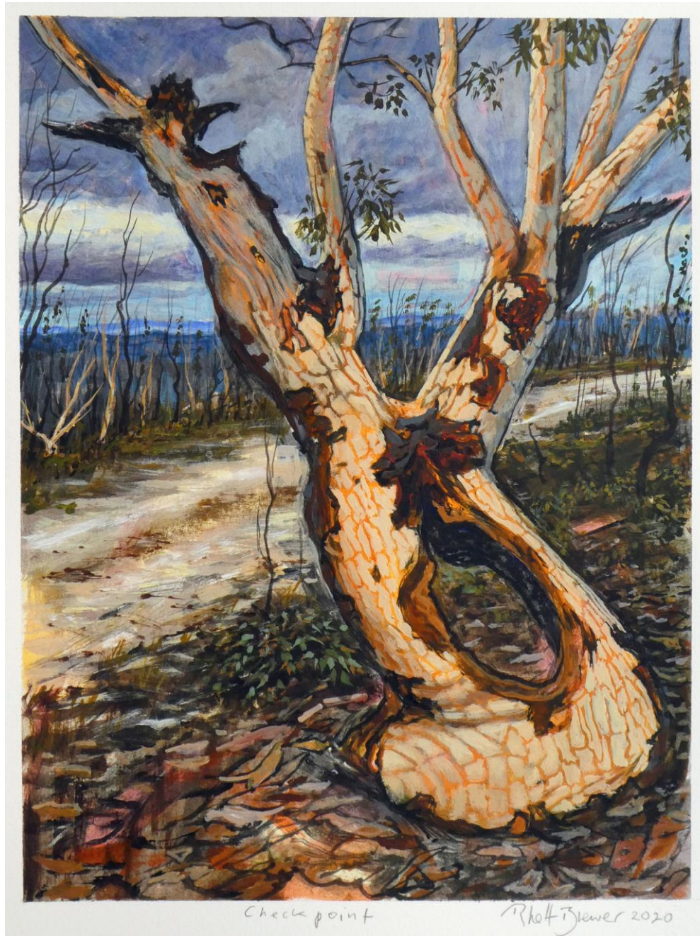
'Checkpoint' 2020; acrylic on 640 g.s.m. watercolour paper, 33.9x28cm, $850