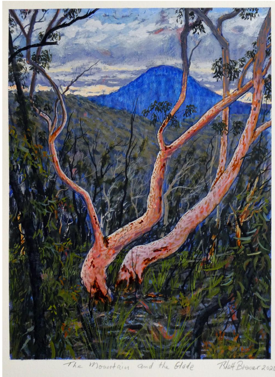
'The Mountain and the Glade' 2020; acrylic on 640 g.s.m. watercolour paper, 33.9x28cm, $850