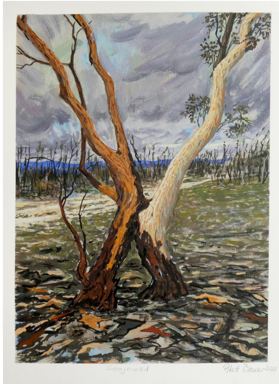
'Conjoined' 2020; acrylic on 640 g.s.m. watercolour paper, 33.9x28cm, $850