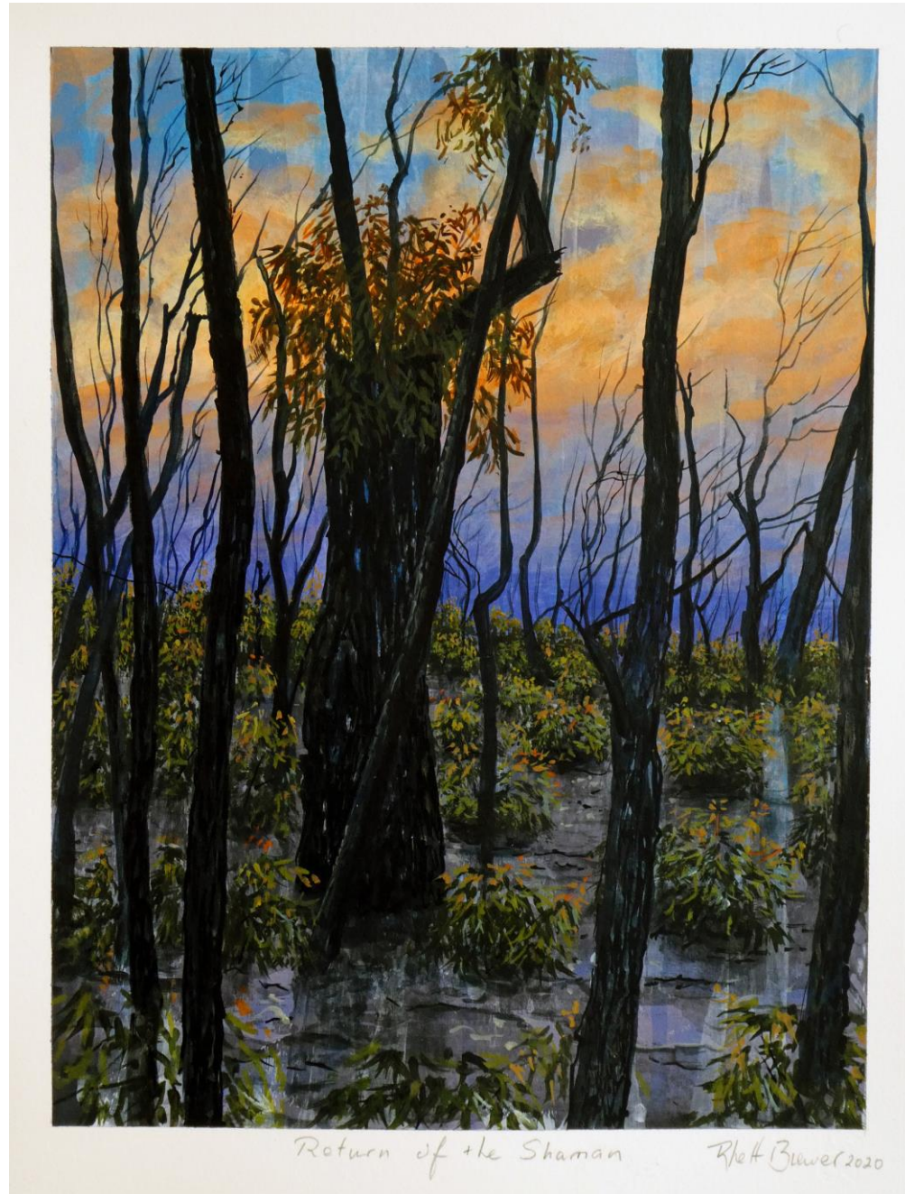
'Return of the Shaman' 2020; acrylic on 640 g.s.m. watercolour paper, 33.9x28cm, $850