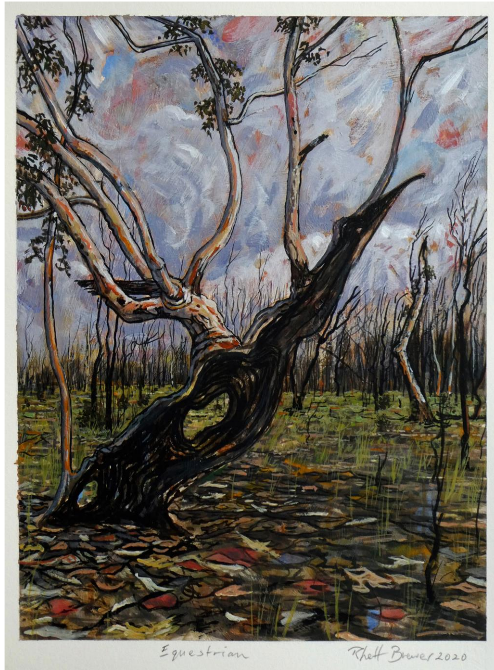
'Equestrian' 2020; acrylic on 640 g.s.m. watercolour paper, 33.9x28cm, $850