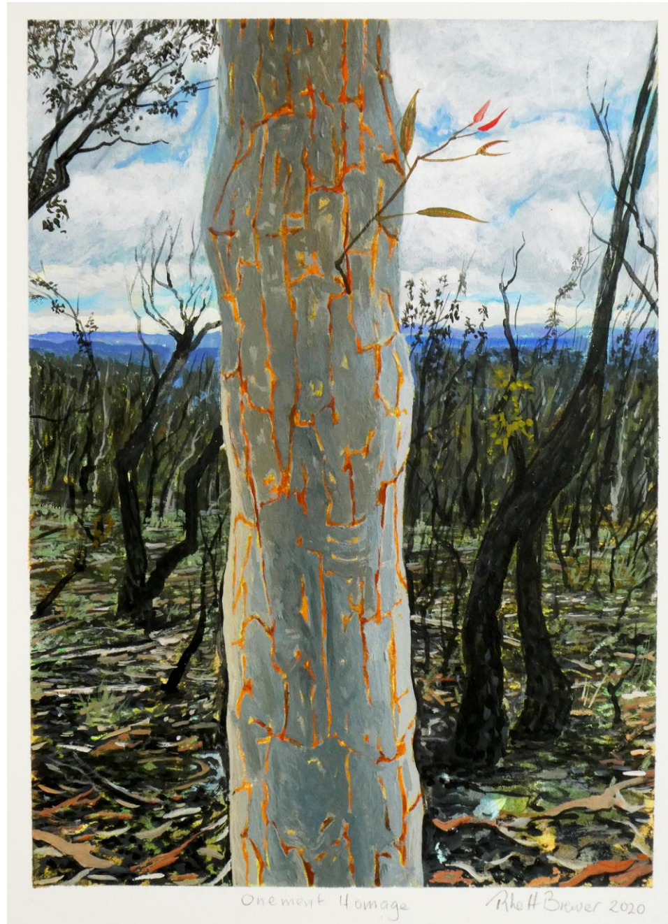
'Onement Homage' 2020; acrylic on 640 g.s.m. watercolour paper, 33.9x28cm, $850