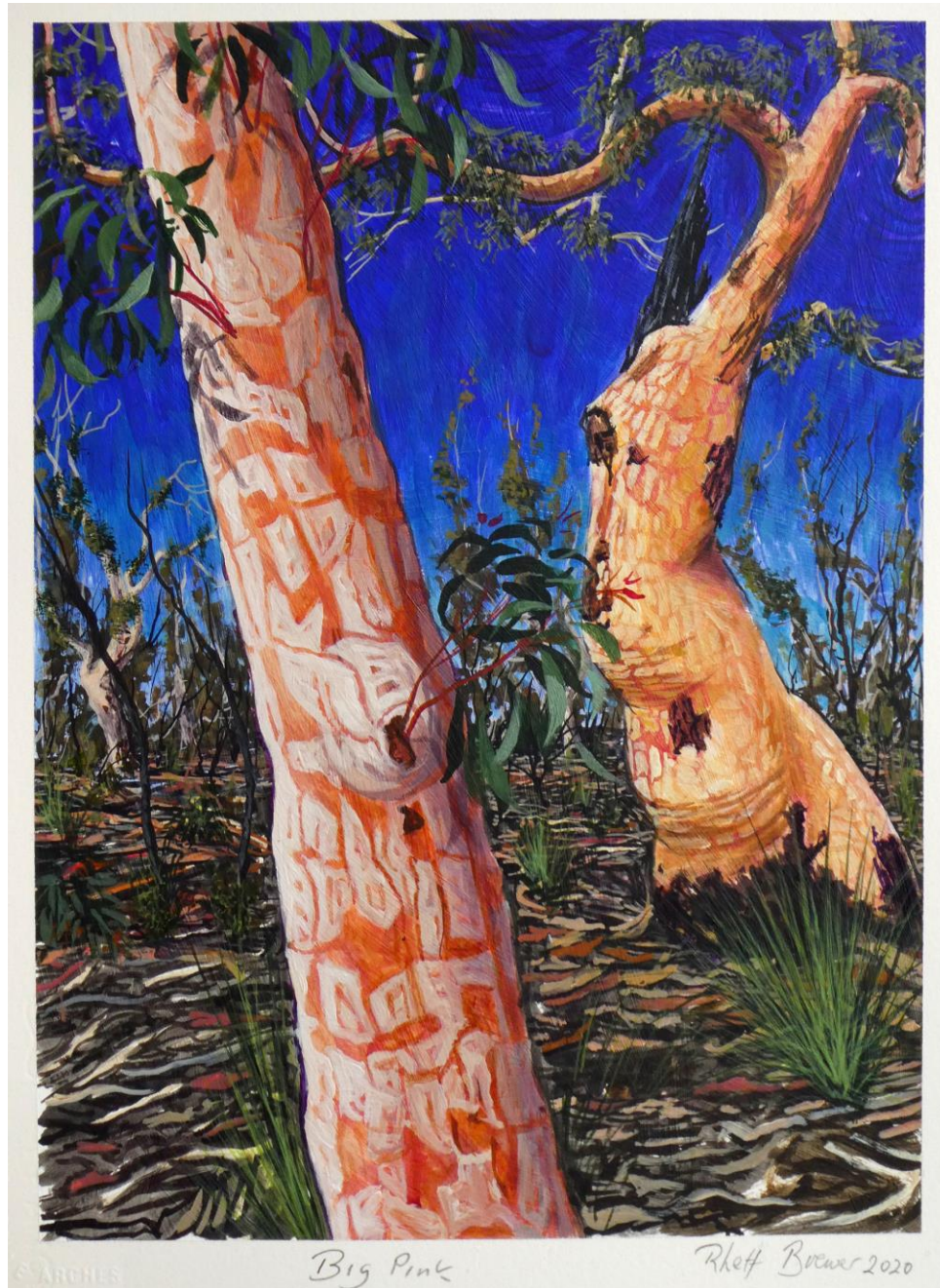
'Big Pink' 2020; acrylic on 640 g.s.m. watercolour paper, 33.9x28cm, $850