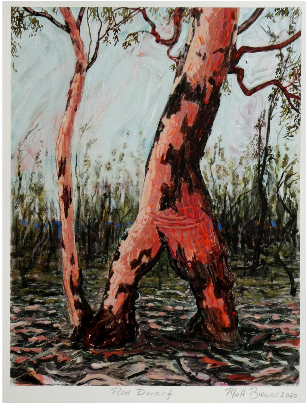
'Red Dwarf' 2020; acrylic on 640 g.s.m. watercolour paper, 33.9x28cm, $850