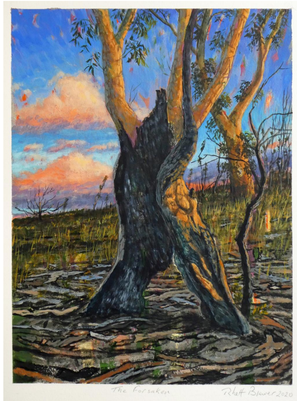
'The Forsaken' 2020; acrylic on 640 g.s.m. watercolour paper, 33.9x28cm, $850